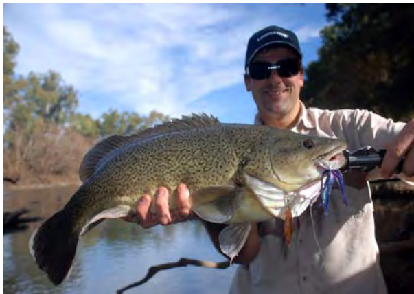
Ash's Brother with a Trout Cod