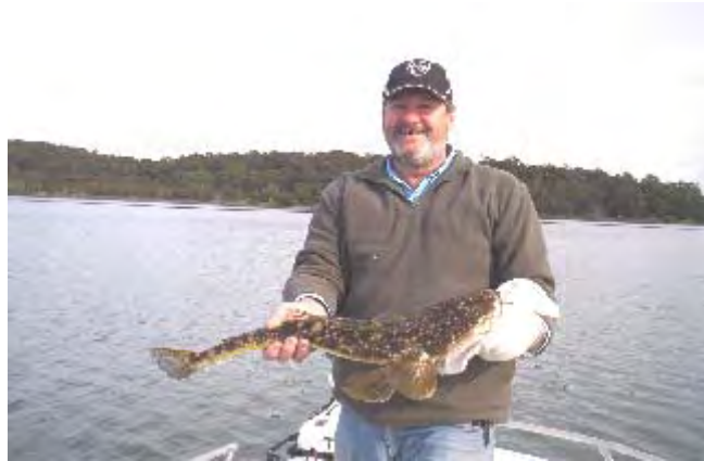
My PB Flathead