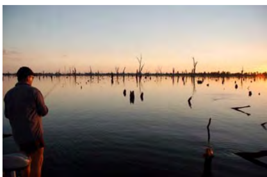
Surface Lourcing MULWALA -Ashley Barber