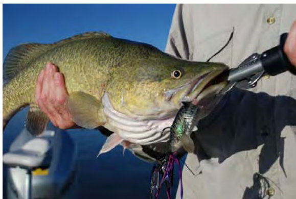
64cm COD "Mumbler Victim" -Ashley Barber