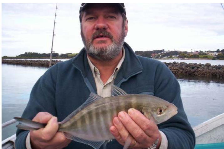
Small Trevally fun on light gear!

Work fills in time between fishing trips.