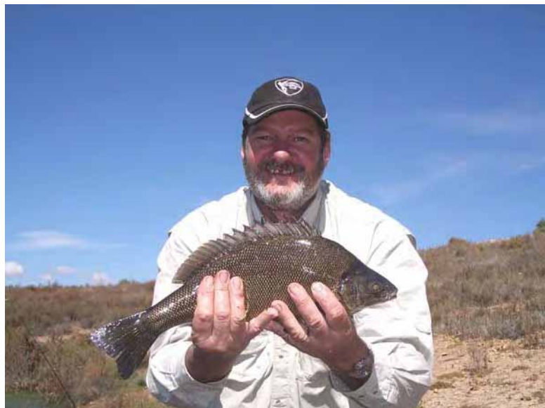
1.56 Kg Windamere Silver Perch!

Work fills in time between fishing trips.