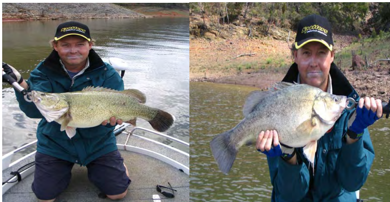
Lemmo strikes a Double order of fish at Burrinjuck Murray Cod all up Yellow Belly