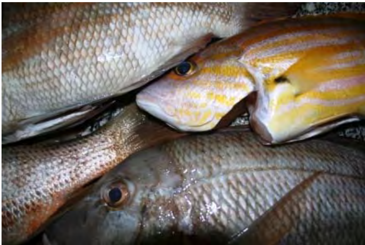
A GOOD MIXED BAG OF FISH (Anthony HEISER)