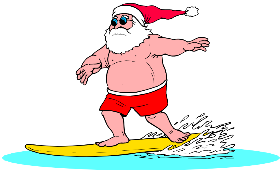
The Day After CHRISTMAS