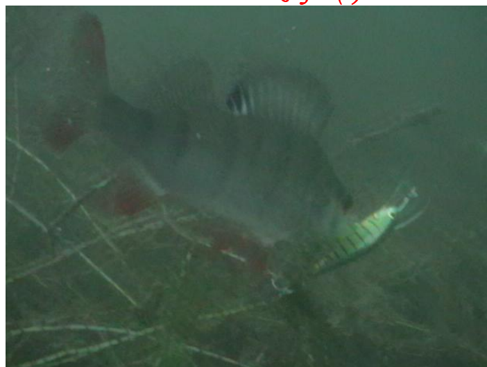
Under Water Redfin (2)