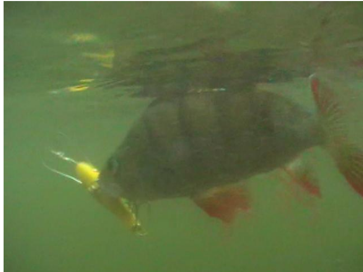
Under Water Redfin (1)