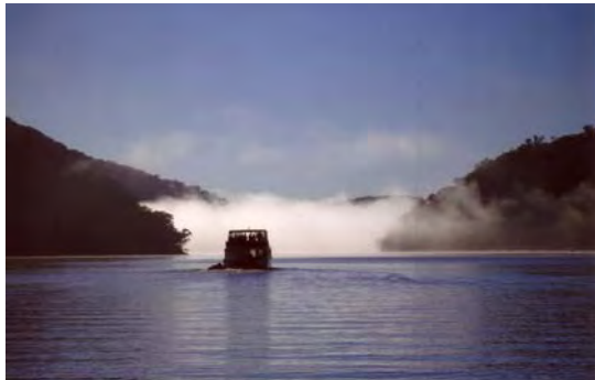
The Clark Mobile Home on the Hawkesbury River