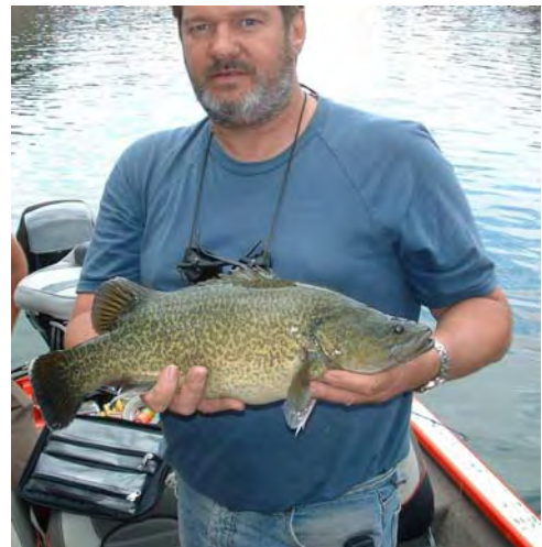
A nice Burrinjuck Cod.