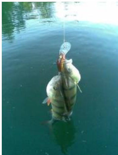
Phil Lawrence – Double-header