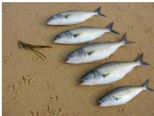
Chris De La Rue – Salmon chorus line