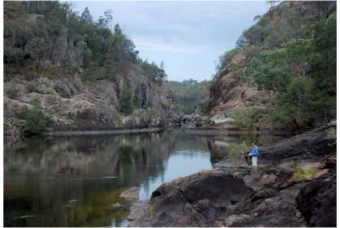
Ashley Barber at Paradise Severne River