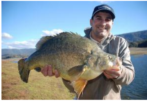
15LB Golden Perch