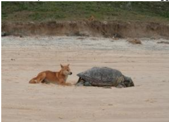
Dingo and the Turtle Race Fraser Island