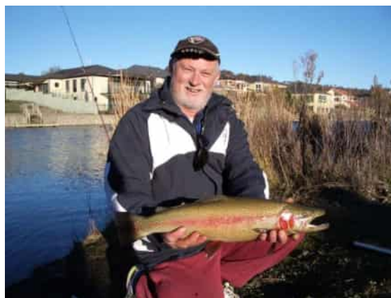
Jarra Rainbow Brian 1.72 kg