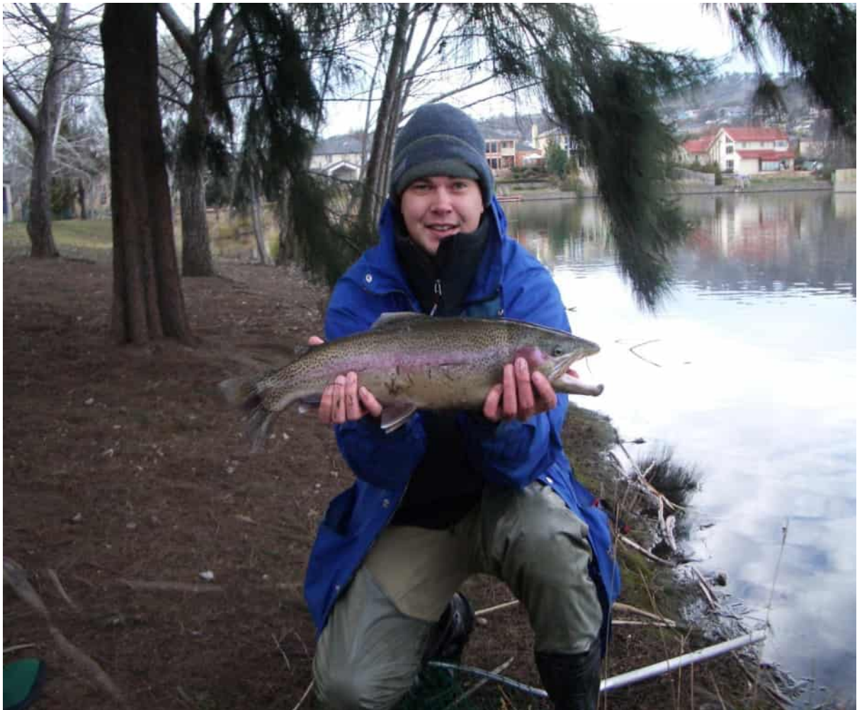
Jarra Rainbow