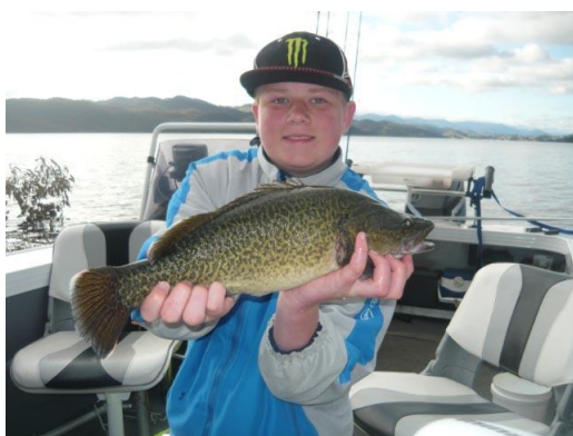
David's BJ Cod