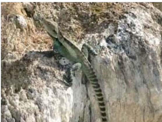
Sally's photo of a Water Dragon