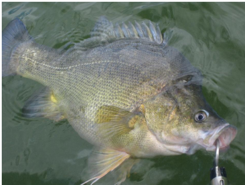
Dave Walton nice Yellow