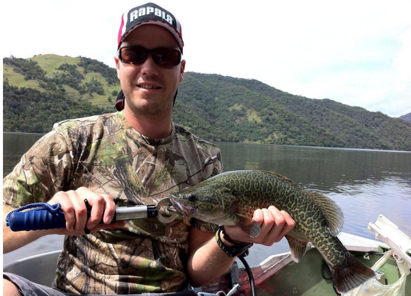
Phil's Little Photo of "Big hearted Burrinjuck Cod"