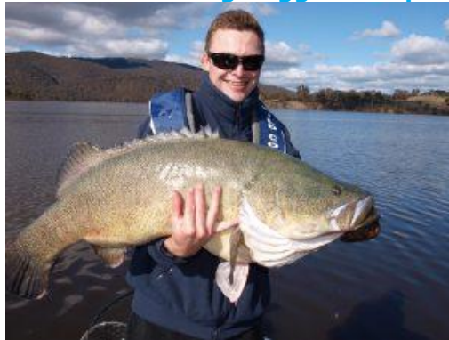
Ash B 110cm Googong Glory Cod