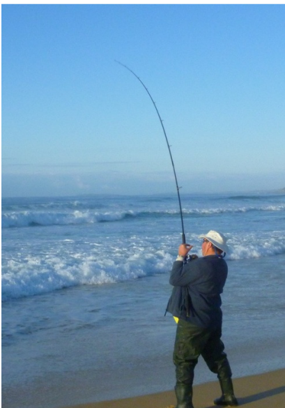
Greg hooked up to a 1.55Kg Salmon

( http://www.williamsonlures.com/products/jigs.php ).