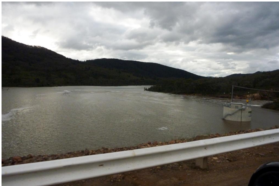
Blowering Reservoir from the Jounama Pondage dam wall