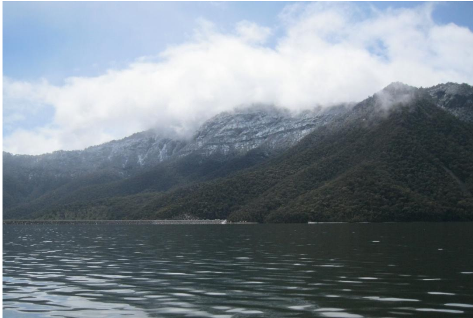
A dusting of snow on the peaks