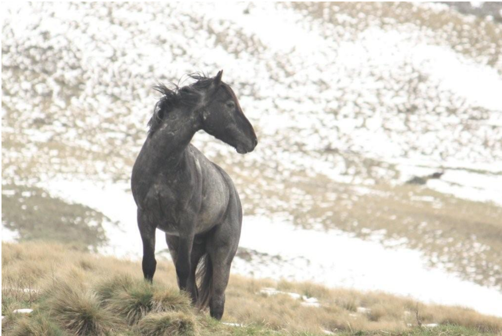
Wild brumby spotted on the drive home