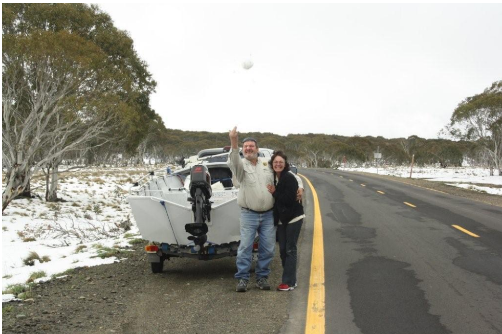
Ending the outing with a snow ball fight!

It was the CFC's turn to host the next ANSA Convention at Burrinjuck on 5-7 November 2010. The last outing for 2010 will also be at Burrinjuck on 4-5 December 2010. If you have not done so already, you should consider putting your name down for the December outing as Burrinjuck is now 103% full (as at 19 October 2010) and the cod season starts on 1 December 2010.