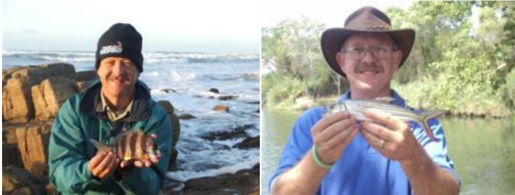
Eerste Wilde sml

This little place is the last stop before you go through the border into Mozambique. My target fish this time was the fresh water tiger fish. Only tried to catch it once before about 10 years back. I had to be a bit more careful this time as I was fishing an area where there are 4m + crocodiles as well as quite a few hippo sharing my fishing ground. I only caught the one little guy but that fighting spirit is the best I have ever felt. Kg for kg I have never felt that power on any other type of fish and you guys know I have been around.