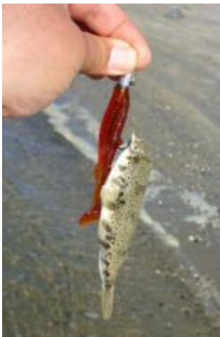
Anthony Puff on Plastic