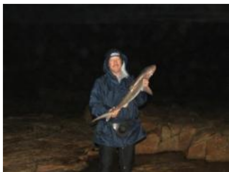
Brons Whaler haai sml

The pictures will show that the edibles were very absent during our few days there. O yes I was into a nice big shark one night that was really taking line. Decided to get on top of a big boulder to try and prevent it from cutting me off. No such luck unfortunately. Once the line parted I lost my balance, fell off this boulder and hurt my knee (Ligaments according to my buddy). Seven days later and after a variety of 13 hour fishing marathons during those seven days I found out that it was actually a broken knee and not ligaments. The finer details of how many pain tablets I went through are another day's story.