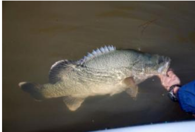
Good release Ashley