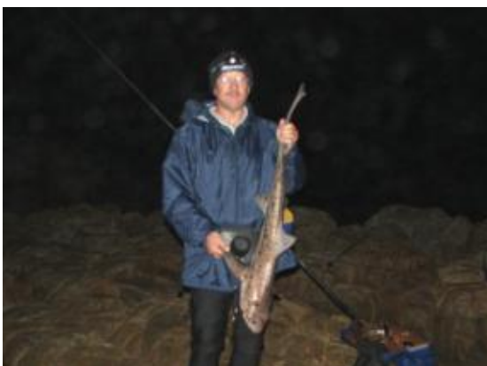
Spotted Gully Shark sml

Hi there to all members that I know and hopefully to a couple of new members as well. Yes I know I am guilty by not keeping in touch but things really seem to be picking up again on our side. Not the same as being with all my friends back in Canberra but business does seem to be going well again. Hope you guys are all well. This is just a quick note of my so called "successes" next to the water. Can't remember if I told you about the salt water outing. If so fast forward to the next paragraph Salt water outing was in a small village called Gouritz on the east of the Cape Province. Size wise I did not have much success but the variety made up for that. We decided to target edibles during the day and sharks during the night.