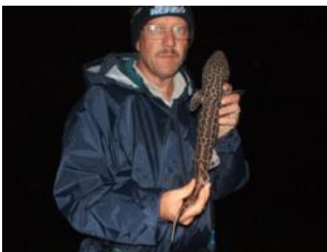
Luiperd Skammhaai sml

My last outing was only a day outing to another small village called Komatiepoort.