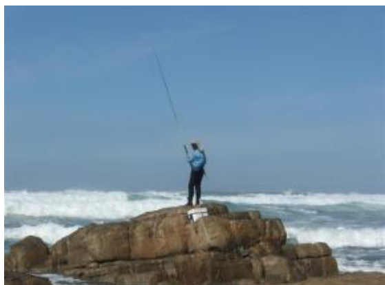
Andre ops die rotes sml