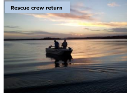
Rescue crew return