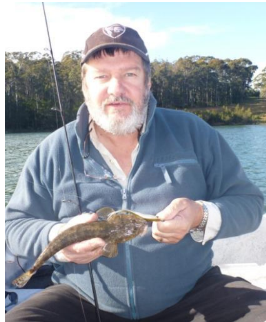
Another Corunna Flattie!!