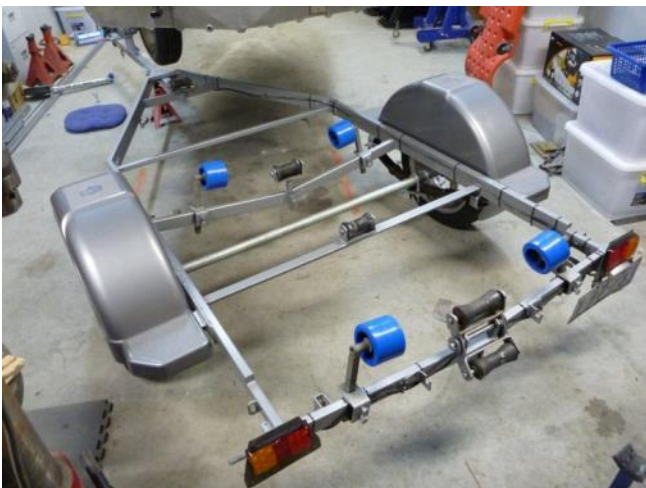
Trailerable heavy duty cover

Fully refurbished trailer (Nov 2011), with new axle, galvanised hubs, bearings, plastic mudguards, boat rollers, and spare wheel mounted on its own new spare hub & bearings. Submersible LED lights