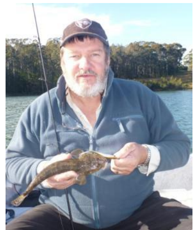
Another Corunna Flattie!!