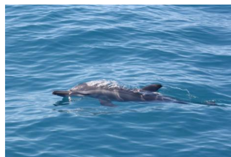
Dolphin swimming alongside the Billistic