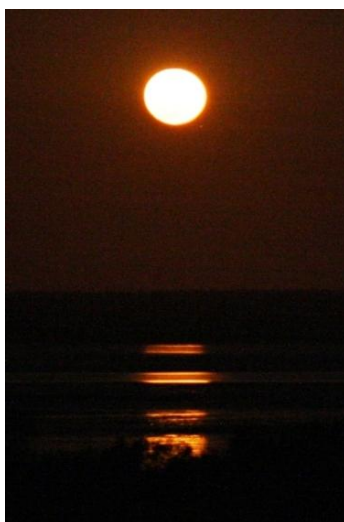
Staircase to the Moon