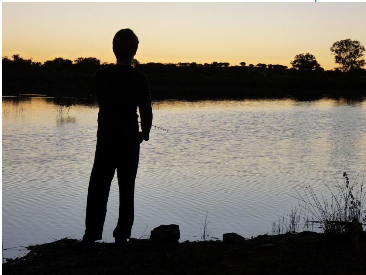
Fishing the Imperial Lake outside Broken Hill

Winner of the November 2011 Photo Competition