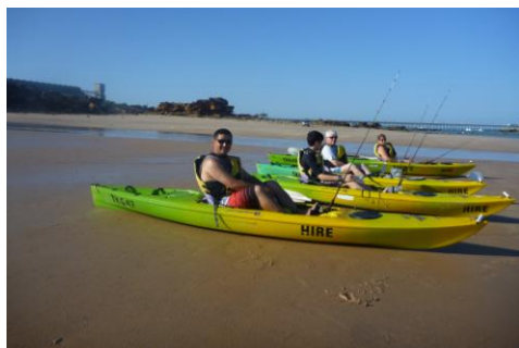
Waiting for the tide to come in!