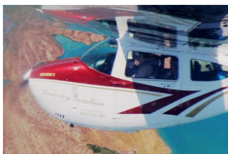
Joy flight over Horizontal Falls