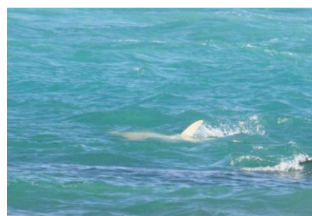
Three metre hammerhead shark chasing baitfish off Entrance Point