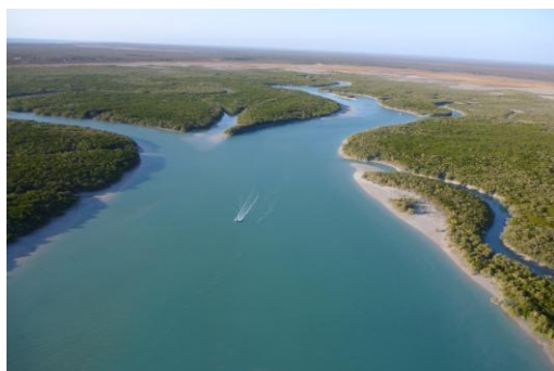
Dampier Creek, Broome