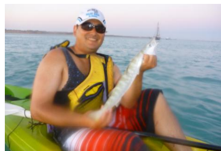
Barracuda caught off Entrance Point