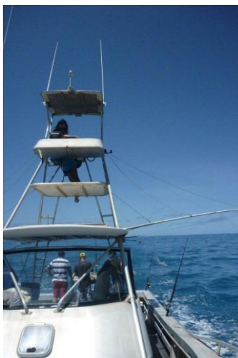
Trolling for sailfish aboard the Billistic