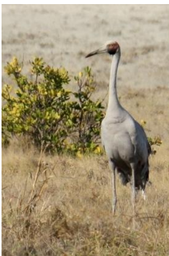
Brolga near Willie Creek