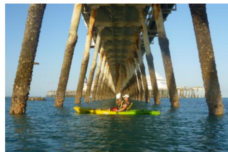
Kayaking around Entrance Point