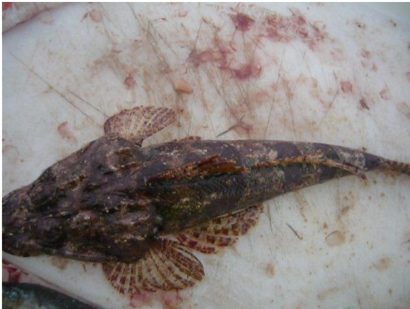
Tasty South Coast Flathead – Brian Stacy