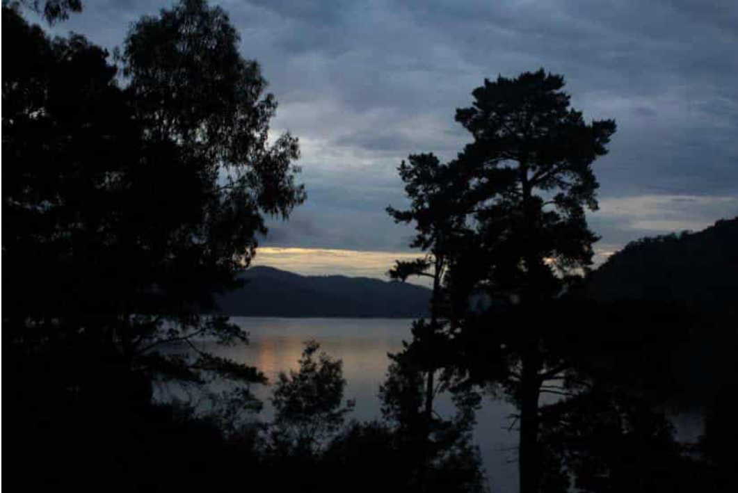
Morning light hitting the water at Lake Burrinjuck on day one of Cod season

The Second CFC versus Morven Inter Club competition was held on 1-2 December 2012 at Lake Burrinjuck. Both clubs were well represented by a contingent of anglers vying to win one of the trophies for longest Golden Perch, longest Murray Cod and the trophy for the club with the longest aggregate length of natives caught.