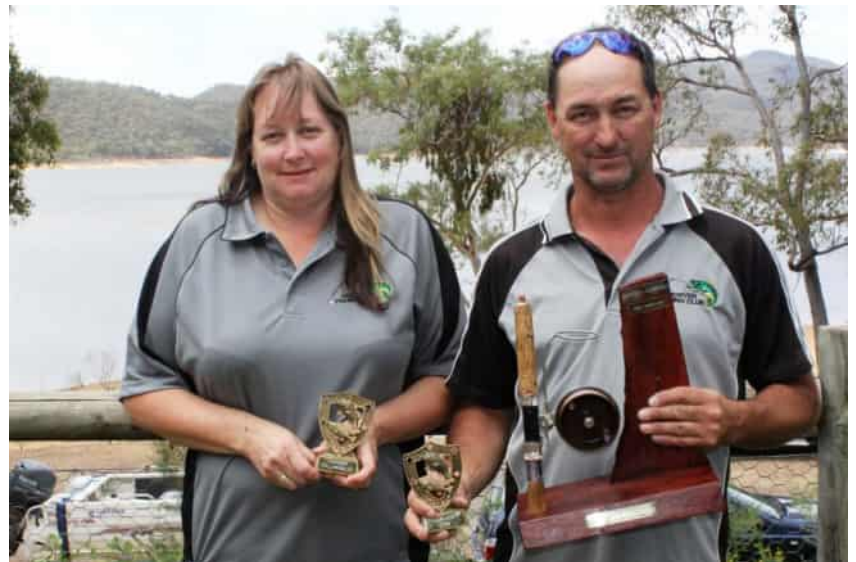
Morven Fishing Club Trophy Winners

Everyone who attended agreed that the CFC – Morven Inter Club was a great weekend and we look forward to meeting Morven again next year. Many thanks to the members of the Morven Fishing Club for hosting a fantastic BBQ dinner and for your hospitality on the weekend. Our next event is the annual Carpathon on 13 January 2013 and our first Outing for 2013 is at Tuross on 26-28 January 2013.