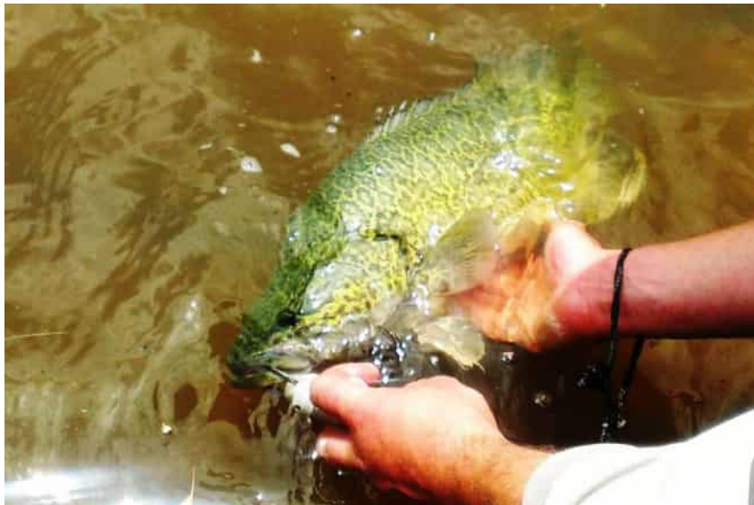
64 cm Murray Cod being released

Both clubs joined for dinner at Lawlers around 7 pm. After putting in long hours hosting the Burrinjuck Convention the month before, it was a real treat being spoilt by the hospitality shown by the Morven Fishing Club, who put on a fantastic BBQ dinner for us all.