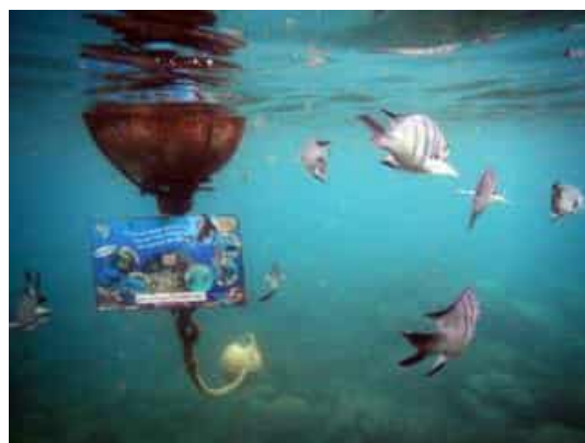
Brian Stacy: Underwater camera shot from cruise trip