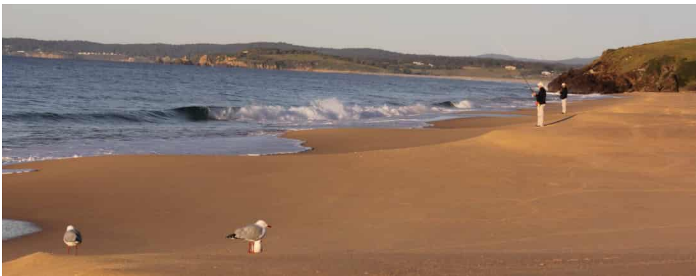
The Clark Brothers fishing Cemetery Beach.