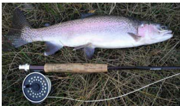
Jon Vogel: Catch of the Day