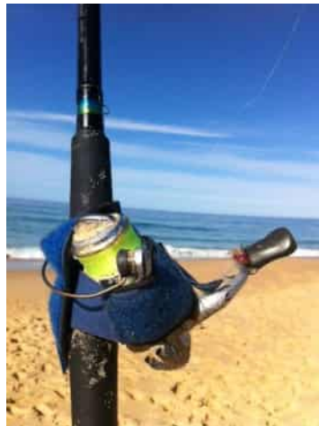
Left: Another of Anthony's Okuma Avenger reels bites the dust after striking a bream on 1 kg line (he fishes with a Shimano Nexage now!). Right: Nothing fixes a broken Okuma Avenger reel better than a bit of Velcro.