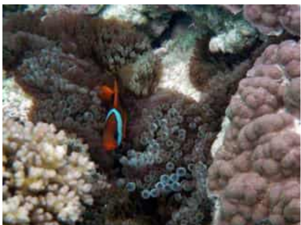
Brian Stacy: Underwater camera shot from cruise trip