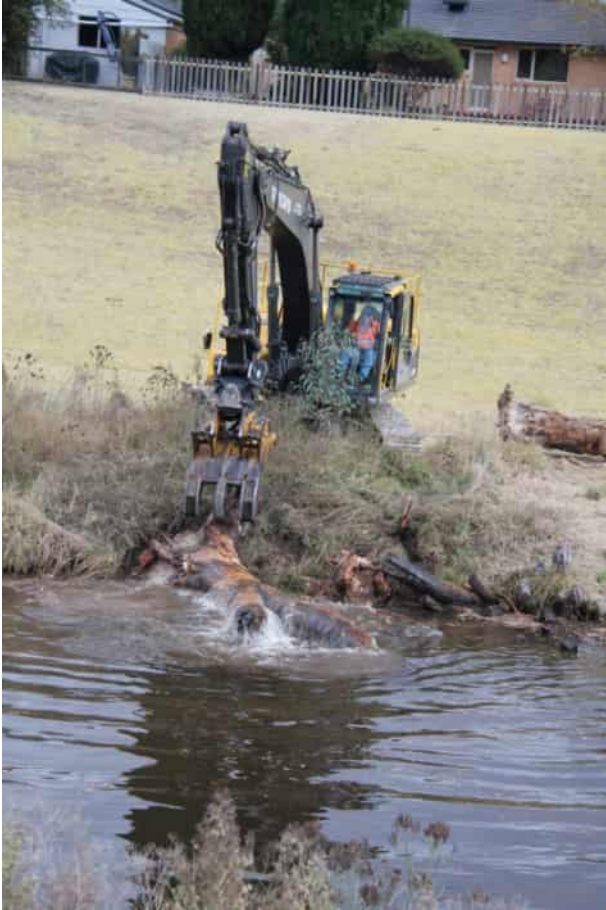
The Excavator placing one of the snags into position .

engaged Terry Plant Hire from Wangaratta to operate the excavator to install and pin the snags in the river.