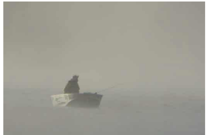
Navigating through the fog It's hard to tell from the photo on the left but are they wearing their life jackets?