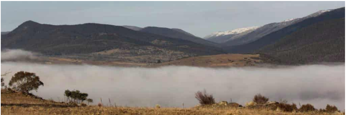
Lake Jindabyne shrouded in fog.

Jon Vogel elected to bank fish opposite the boat ramp in the afternoon and I decided to walk to the Eucumbene Arm and spin off the bank there. Unfortunately, none of Andrew's skills rubbed off on me enough – I had plenty of follows from brown trouts off the bank and a kilo plus brookie but no hook ups. It was not until after dusk I landed a 0.47 kg rainbow on a brown trout patterned rapala and a 0.27 kg Atlantic Salmon.