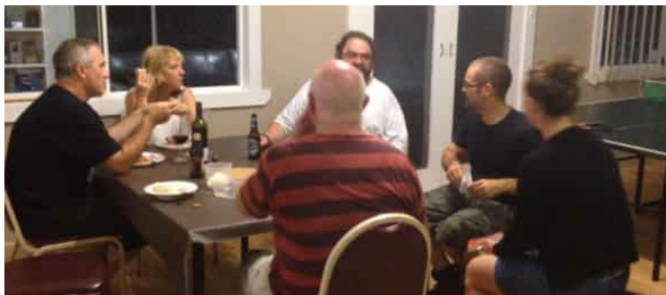
The 'I wonder how Australia is doing at the cricket' subcommittee convenes at Nowra.