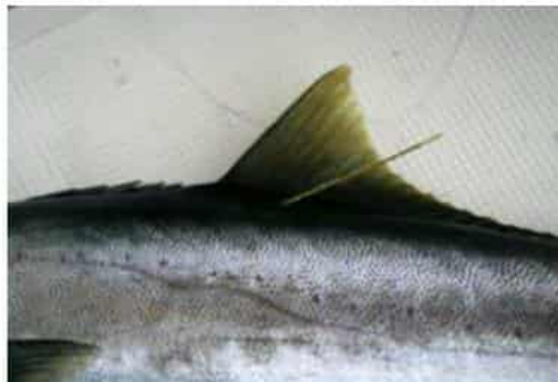
Correct pelagic tag location on a kingfish