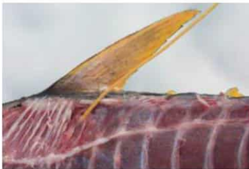
Dissected view of a correctly located and locked tag

Try to insert the tag at an angle of at least 45° to reduce water friction and then twist the tag applicator before removing it. In effect, you should be trying to hook the barb of the tag around one of these spines, which then locks the tag in place.