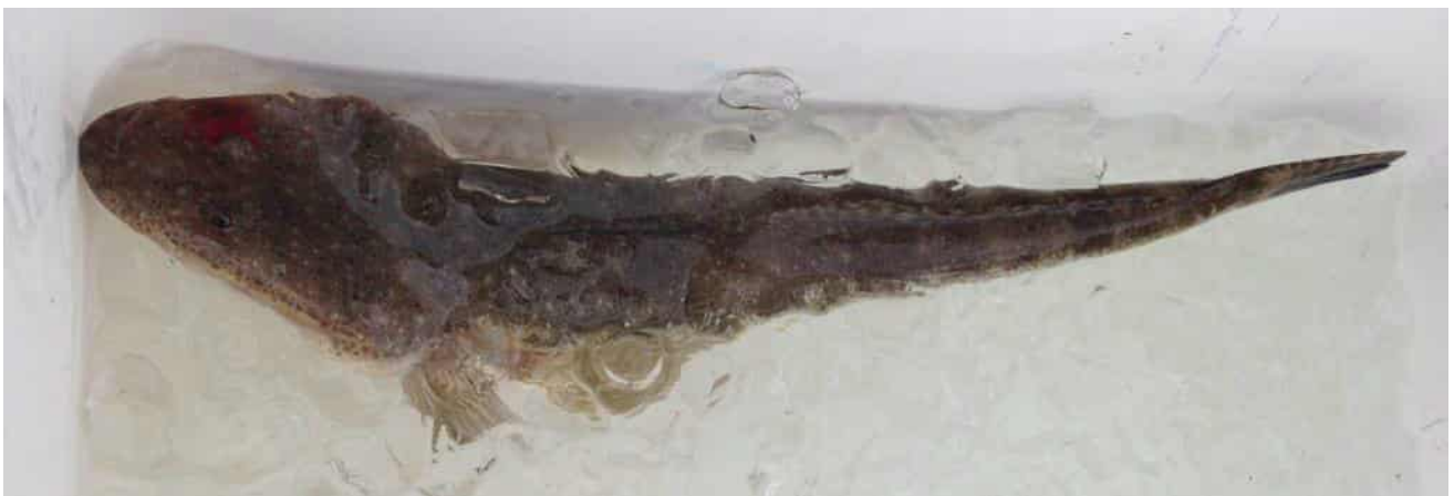
The first fish for the outing fell victim to a 2 inch 'Radioactive Rooster' Atomic Prong on a ¼ oz jighead.