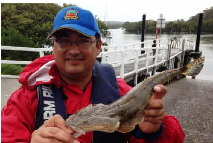
My not as impressive but very tasty 44 cm Dusky Flathead that fell victim to a Berkley's 2 inch Gulp Baby Shrimp.