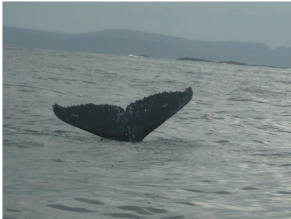
Brain Stacy with a great Batemans Bay whale sighting