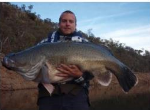
Warren Boyd 12 months ago

Murray Cod: Fishing has been slow over the last month or so. The last couple of weekends have seen the return of sunshine but there has been some winter mixed amongst it. I had a couple of reports last weekend of Cod taken while trolling spinner baits in only 3 metres of water. Most fishos have been trolling the edges with the big gear out the back. I have put in about 9 hours over the last 2 weeks and have not turned a real. I have been fishing only on the warmer sunny days, in the middle of the day. There have been no fish caught over the metre, during winter, which I have heard of. It was 12 months ago that Warren Boyd caught his 114cm Burrinjuck beauty. The water level back then was 46.1% September 1 st will see the closed season for Murray Cod begin. We can expect the cod to start firing during August as the breeding season approaches.