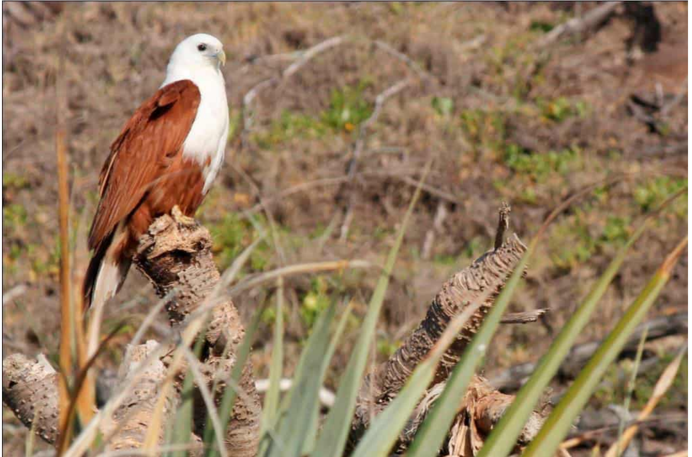
Brahiminy Kite perched on a Pandanas Tree.