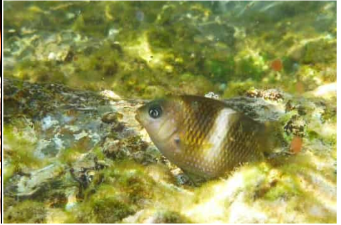
Left: Goanna outside our cabin. Right: Damsel fish in the Champagne Pools.