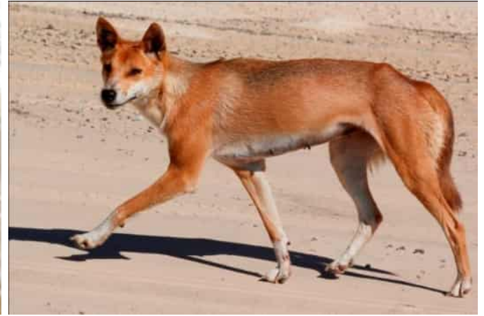
Left: A Green Sea Turtle we thought needed rescuing but was there to lay eggs instead. Right: A Fraser Island Labrador.