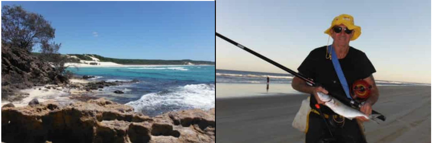
Left: Waddy Point surrounded by algae. Right: Crocodile Bob with the first Tailor for the trip.

We fished the gutter at Cathedral Beach on Wednesday night from 6 pm to 8 pm. It was a pretty quiet session but I landed the first fish for the trip, a 0.52 kg Swallowtail Dart which put up a nice fight. For me, this was a nice moment as it was my first ever legal sized Dart on 1 kg line. I followed this with a 0.3 kg Dart half an hour later. This was also the first time I had ever caught Dart after dark, as I had always thought they were a day species only.