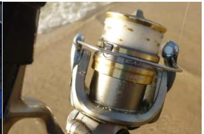
Left: My 0.52 kg and 0.3 kg Dart caught off Cathedral Beach. Right: My reel even after I spent 10 minutes cleaning as much of the algae off my line as possible.