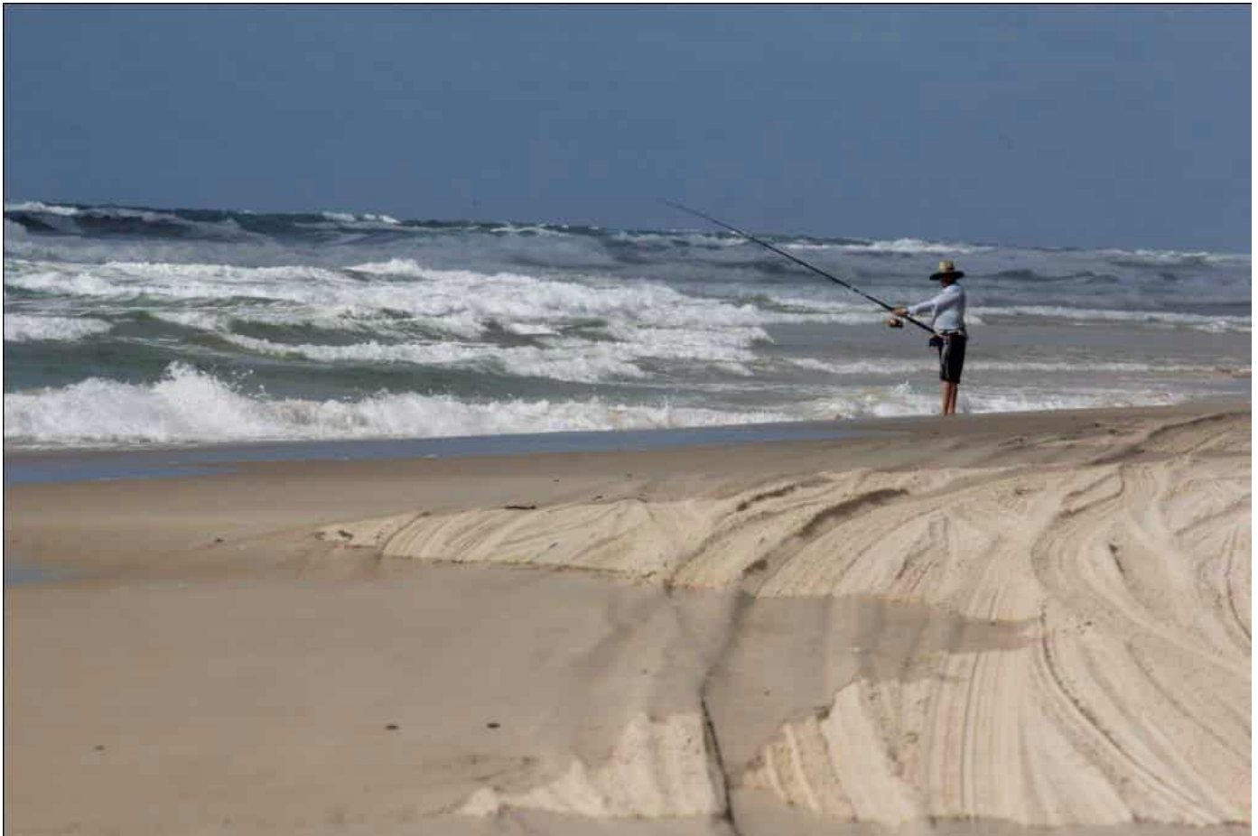
Beach conditions on the first morning of the trip. Fortunately, the beach became very fishable later that day.

The fishing throughout the trip was slow and we had to work hard for the few fish we did catch. None of us had fished Fraser Island so late in the year so we were unsure what the fishing would be like. In addition, the fishing almanac and tide times were not favourable. The weather was generally pleasant but with 15-20 knot winds most of the time, blowing initially from the North-East, and then NNW for the remainder of our trip.