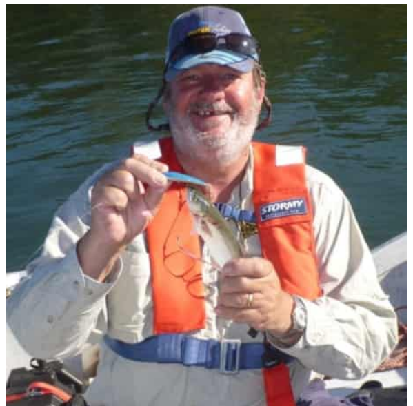
Work fills in time between fishing trips!!

This month's quote is:- "There's a fine line between fishing and just standing on the shore like an idiot. - Steven Wright"