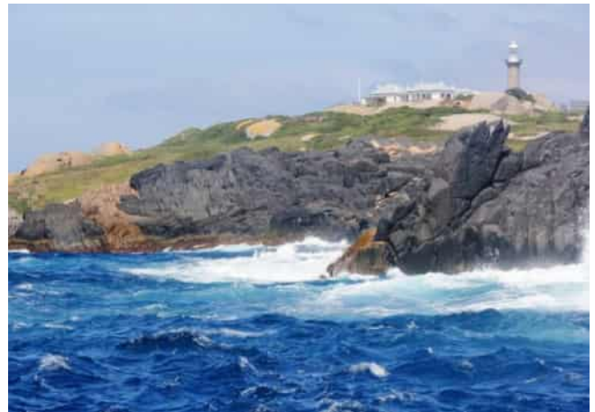
'Montague Island Blues' Photo by Anthony H