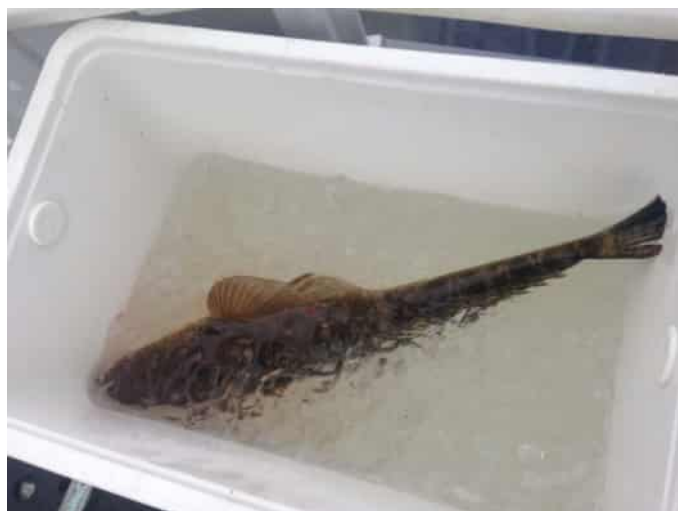
My Flathead caught on an unweighted pillie