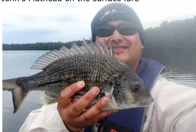
36 cm 0.7 kg Black Bream