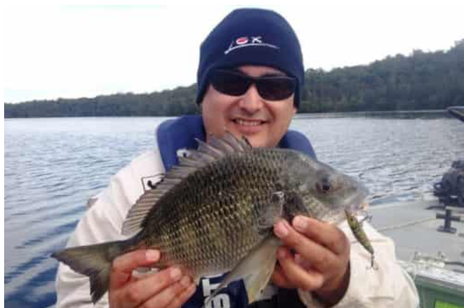
38.5 cm 0.89 kg Black Bream

At first, we had no luck but eventually we started getting follows and boils of water chasing our surface lures. I struck first with my Lure Casting Masters Bream – a PB weighing 0.89 kg on 1 kg line. John followed this with a Flathead masterfully caught on a surface lure. We kept flicking the surface lures and it was awesome hearing the hoof noises from the Bream chasing our lures.