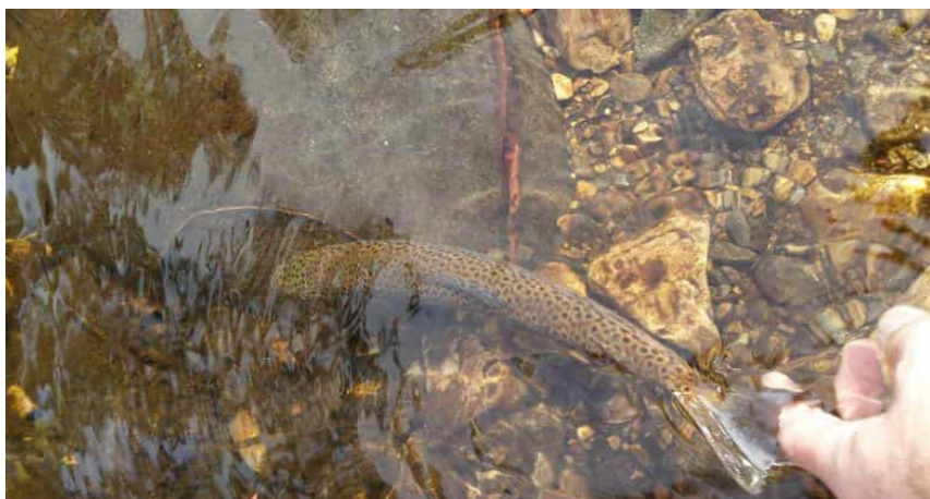
The same trout being released to fight another day