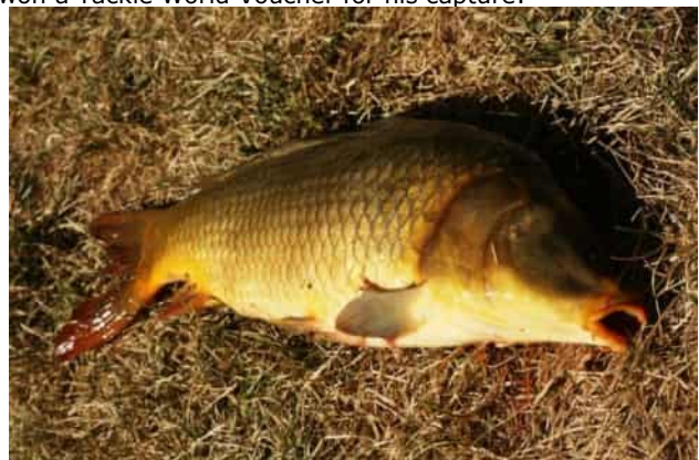
One of two blind Carp weighed in at the Carp-Out.