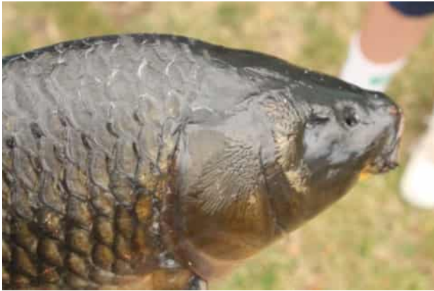
The second blind Carp weighed in at the Carp-Out caught by Bowyn Beatty.