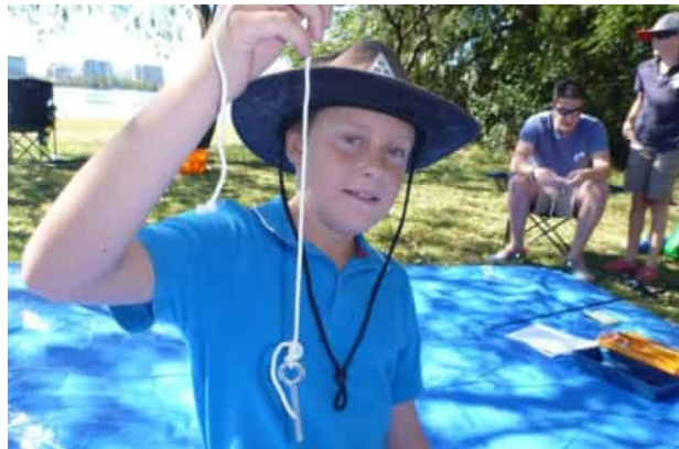
One junior angler has learnt to tie a clinch knot.