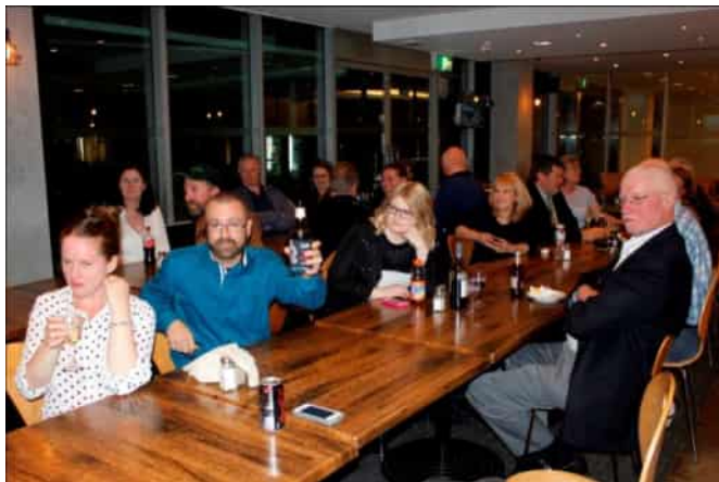
Everyone at the Presentation Dinner.