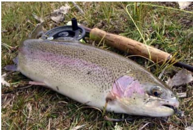
John V – My Favourite Fly for Dixieland Rainbows