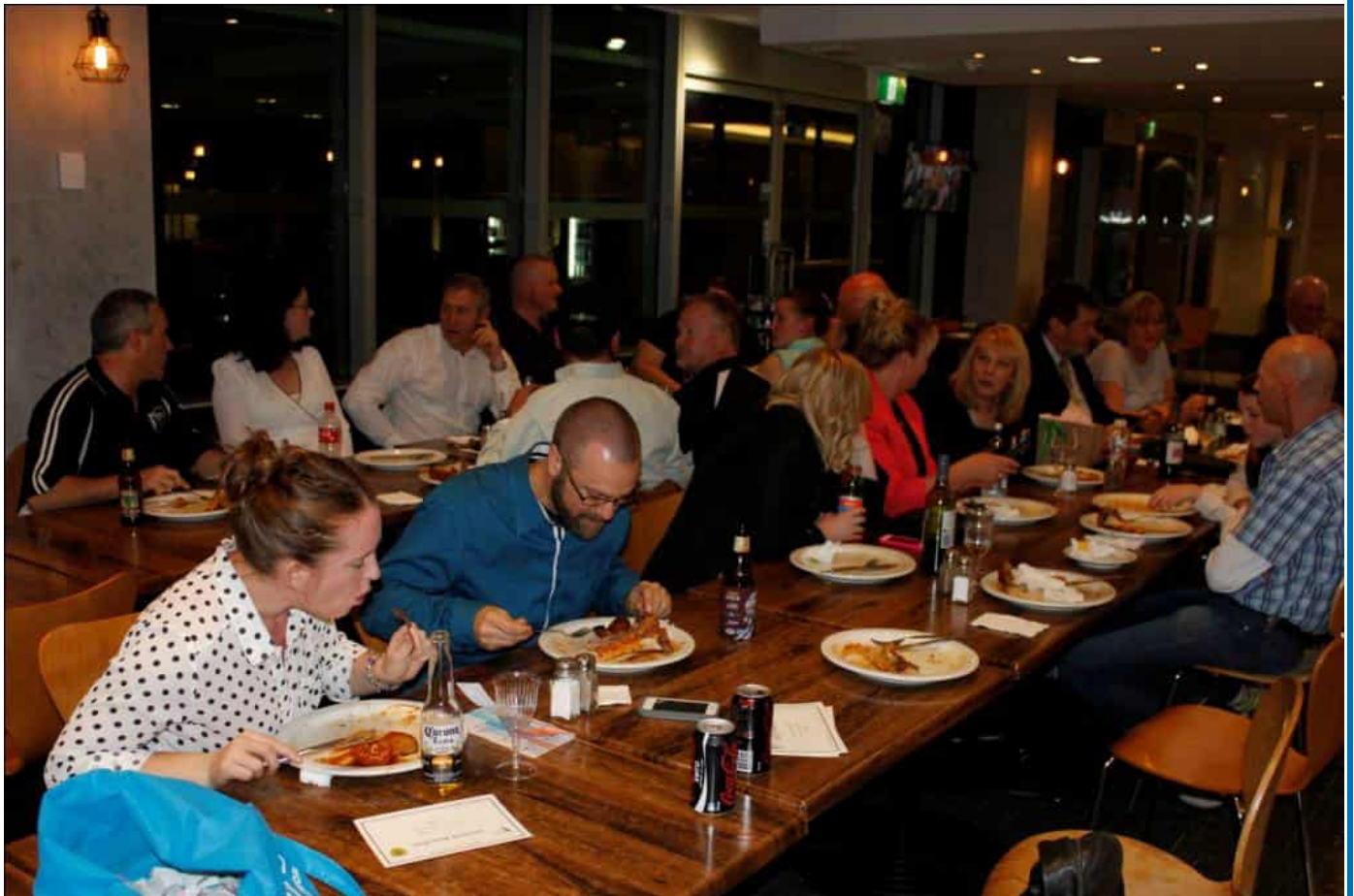
Everyone enjoying dinner courtesy of Mint@Forrest.