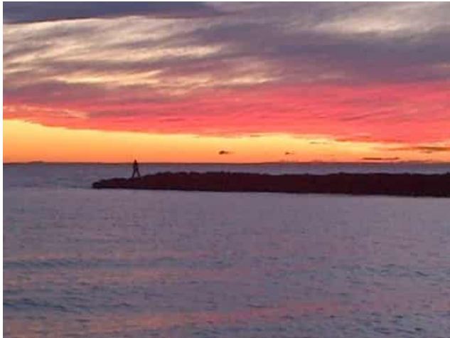
Jamie S – One last cast for the day –