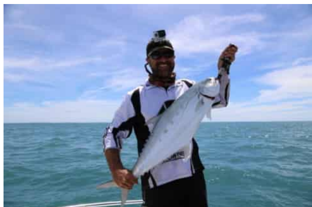
The board fish that got away :-/