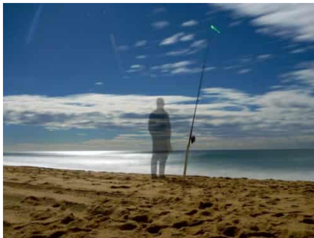
Phil L – GHOST FISHERMAN