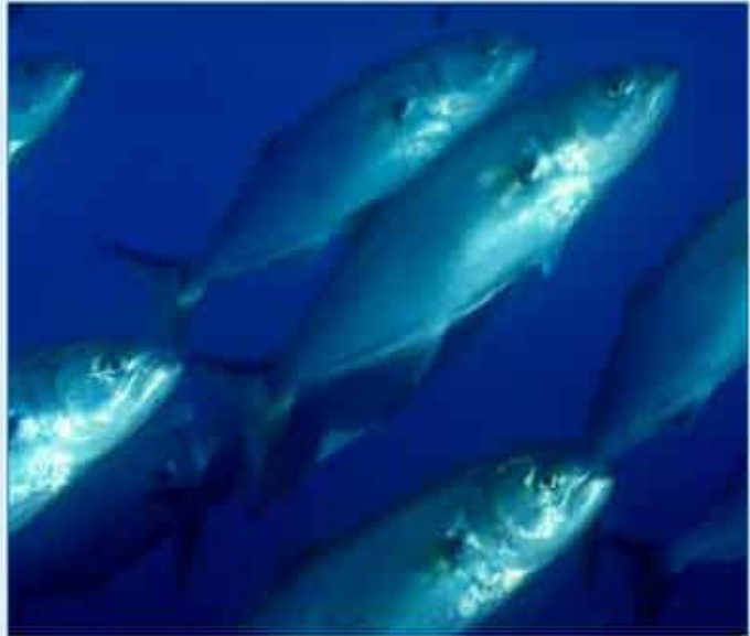
A school of tallor move purposefully over the reef to seek out prey fish.

Tallor are also found around rocky outcrops and reefs along the shoreline. Offshore reefs are another prime habitat, especially for larger tallor.