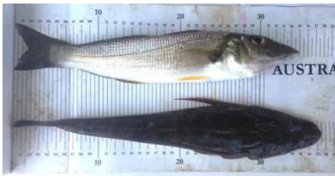
Anthony's Dusky Flathead on soft plastic and 335 mm Whiting on surface lure.