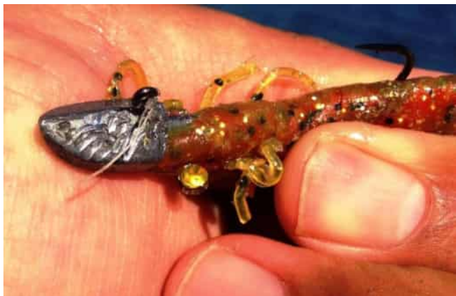
And here's the teeth marks on the jighead from the 1.2 kg Flathead.