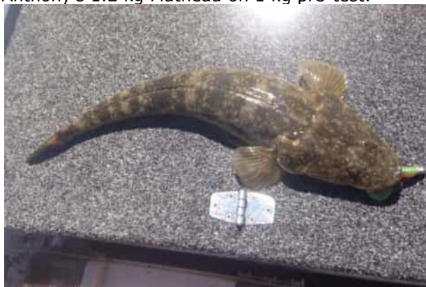
One of Keith's Flathead from Lake Coila