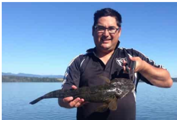
Anthony's 1.2 kg Flathead on 1 kg pre-test.