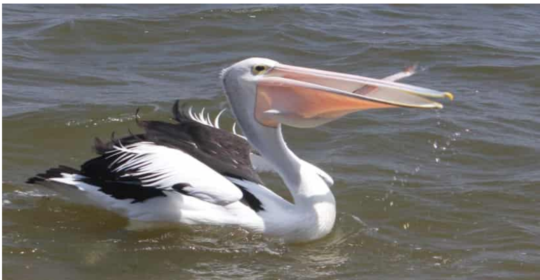
Pelican making an easy meal out of Flathead frames near the cleaning tables at Tuross

Our next outing will be the Carpathon at Bowen Park, Lake Burley Griffin on 8 February 2015 and the Nowra Convention on 21-22 February 2015.