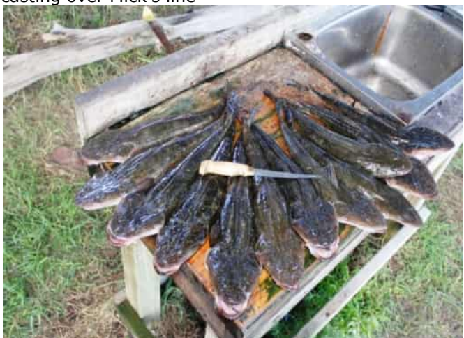
John Bosch and Mick Jewry landed eight and four Flathead respectively at Coila Lake on 25 January 2015.