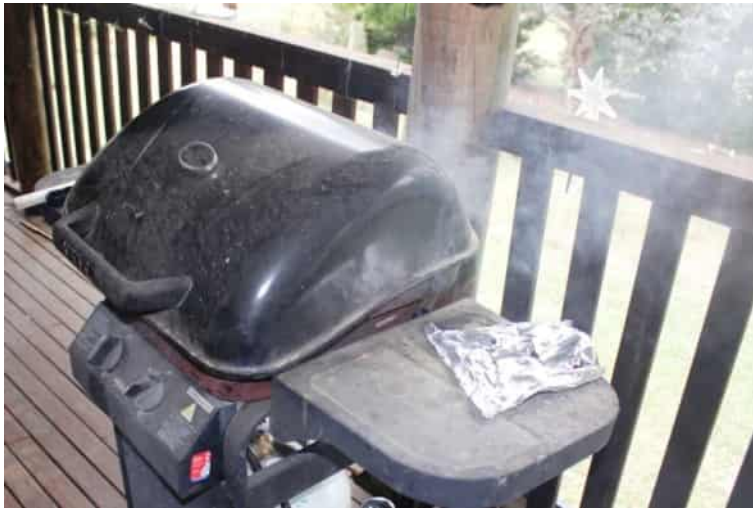
The Flathead Roe getting smoked in my BBQ

This recipe might not be everyone's cup of tea but it was a hit with the Japanese ladies who run the café near my work. I hope to get another opportunity to try this recipe. In the meantime, I'll be researching other uses for smoked roe other than as a seasoning for my bowl of rice.