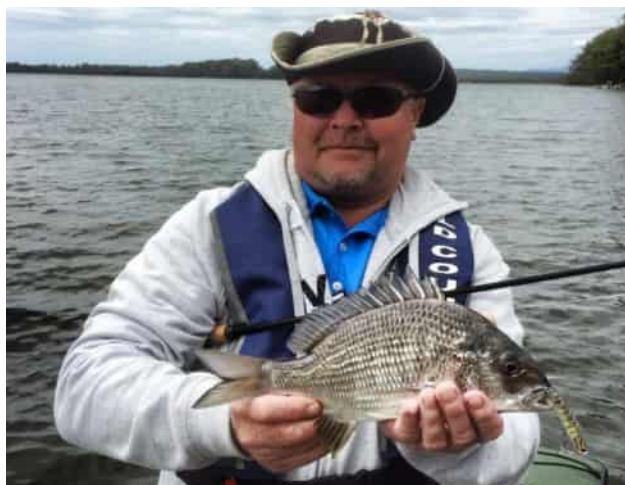
Mick's Bream caught on a surface lure on Australia Day.