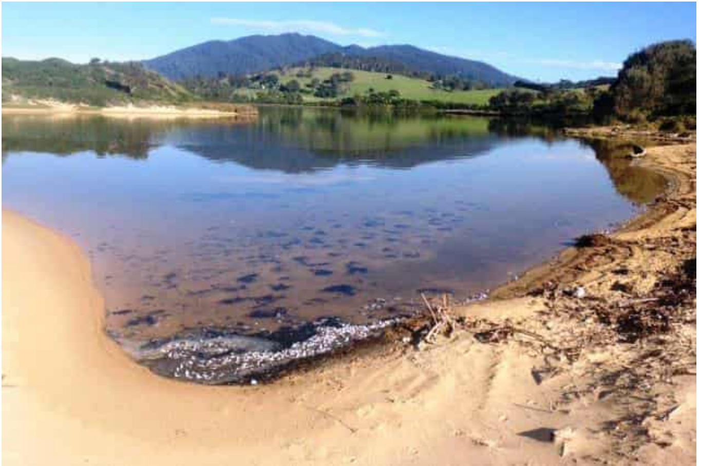
Little Lake at Cemetery Beach was a picture of serenity on Friday morning

The school was moving rather fast and each time we landed or dropped a fish, we then had to run up the beach to keep up with the school. We had chased the school for a kilometre when I got busted off on 1 kg line. We then walked back to where our fishing gear was set up, collecting each fish Shane landed along the way. Half an hour later, the school returned, heading south towards Bermagui. We chased the school again until we ran out of beach.