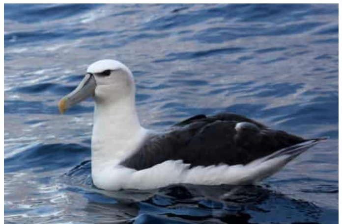
A Shy Albatross (which wasn't very shy in approaching us for a free meal).