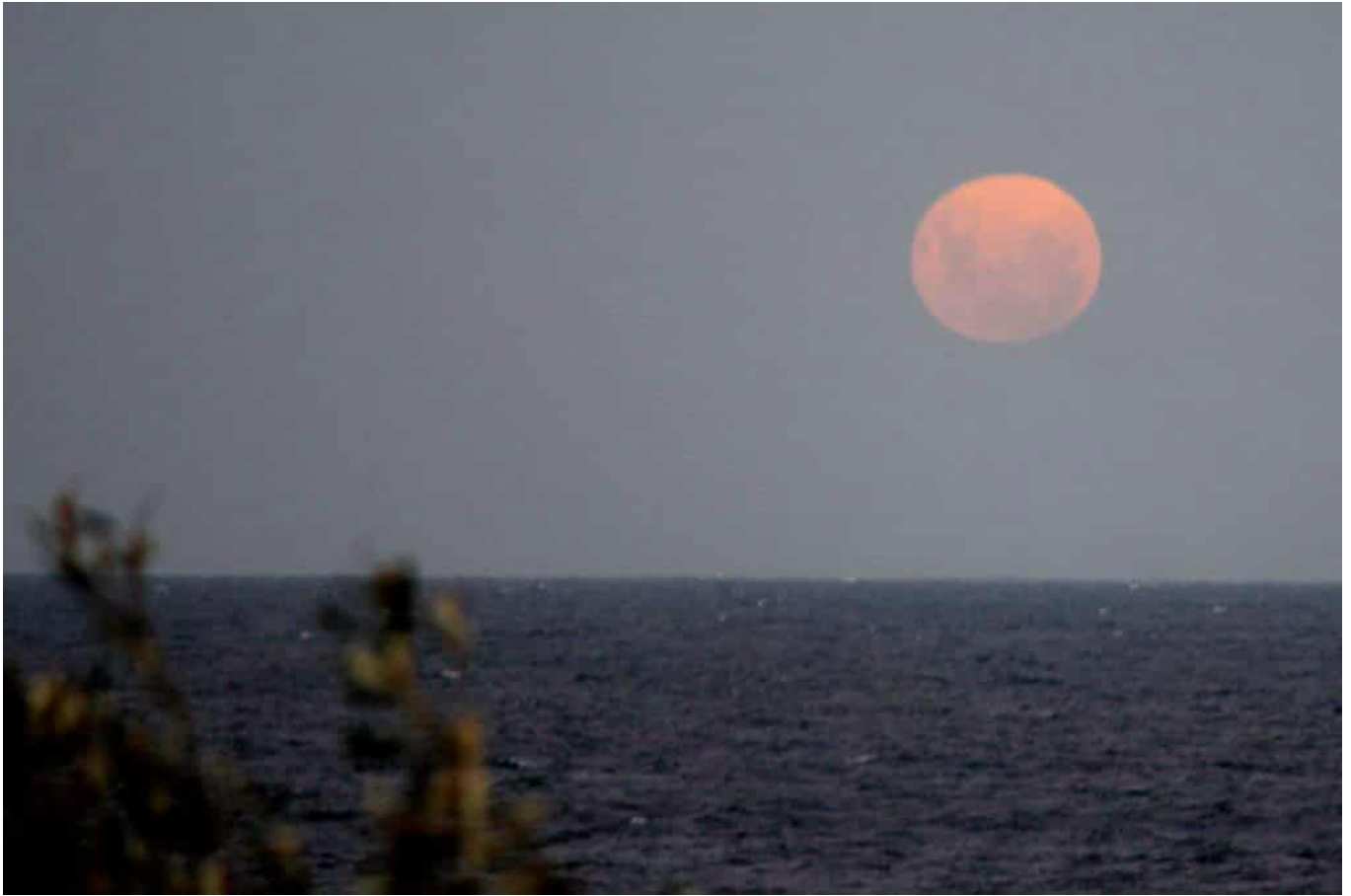
Moon rise at Cemetery Beach