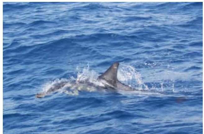
We spotted a lot of wildlife around Montague Island including pods of dolphins, seals, turtles, Albatrosses and Shearwaters.