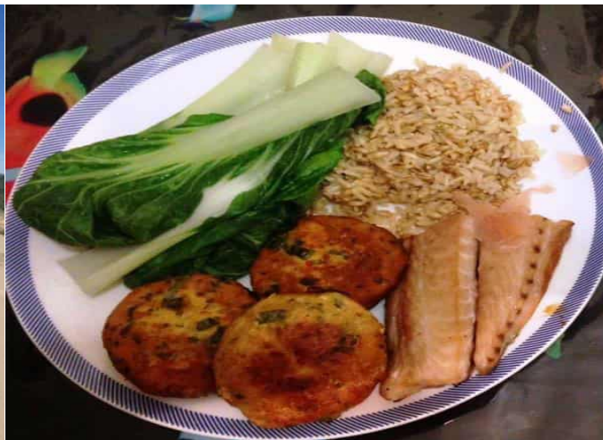
Before: Australian Salmon off Cemetery Beach. After: Thai Fish Cakes and Smoked fillets of Australian Salmon

I've never been a big fan of the eating qualities of Australian Salmon - it can be very chewy and overpowering in flavour. However, I gave these two recipes a go after the Narooma Outing and was very pleasantly surprised. The strong flavour and chewiness was not a problem with either recipe and both turned out to be very tasty meals.