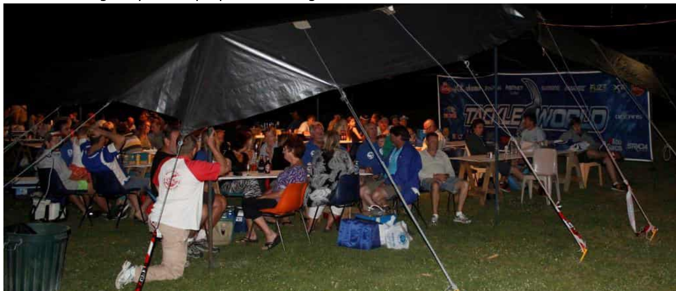
195 anglers having dinner

fish to be caught by those prepared to tough it out.