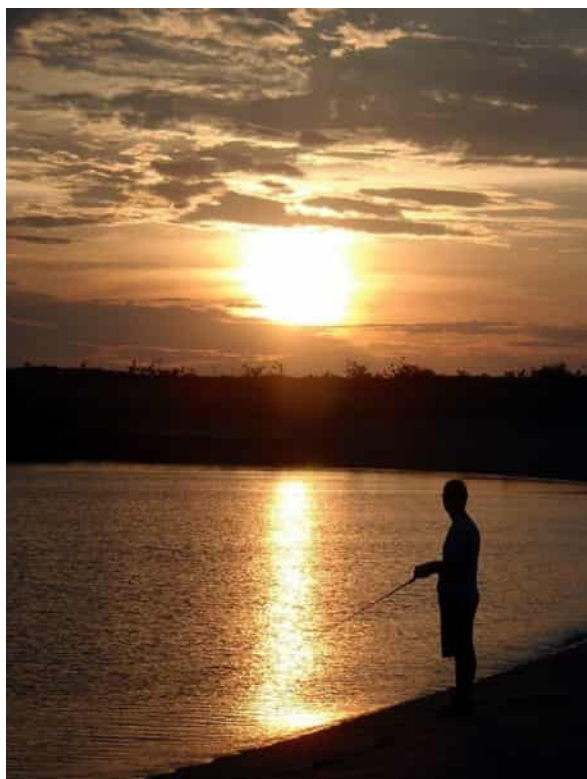
"Sunset Silhouette" Location: Red Bluff, Napier Broome Bay (North Kimberley, WA) Species: None. Tackle: None. Technique: None. It's often said there's more to fishing than catching, and hopefully we've all experienced those moments when a fish on the line would actually be an interruption. This was one of those moments.