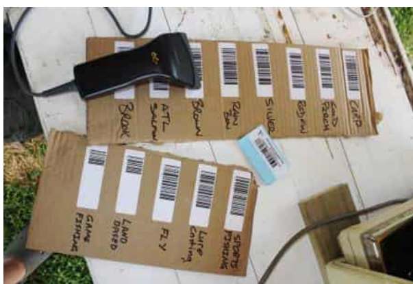
The use of a bar code reader helped speed up the job of weighing in and recording the captures.