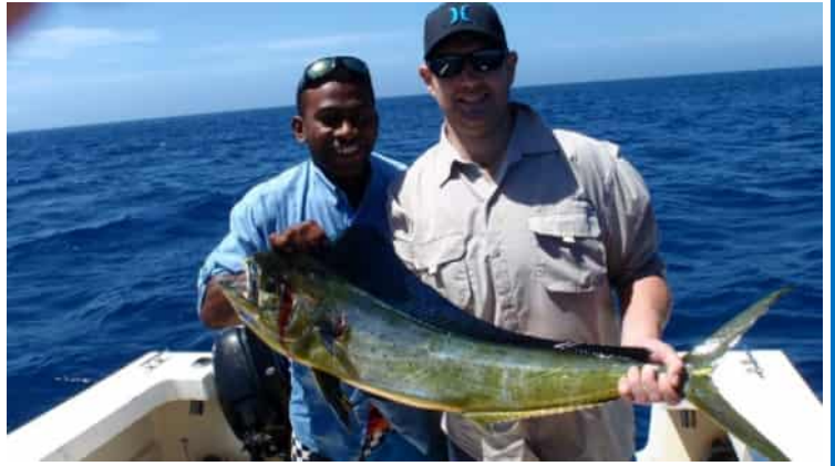
Brendon H - A mahi mahi caught in Fiji about 7kg