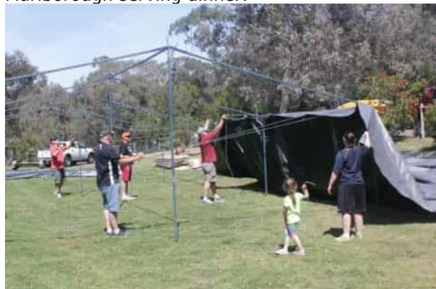
Setting up the dining tent at Lawlers Park on Friday morning.