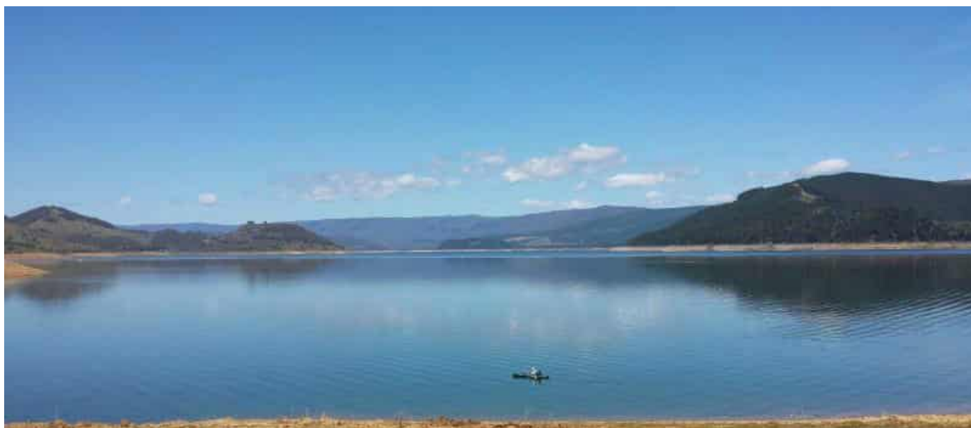
Zane Z - This is paradise!!