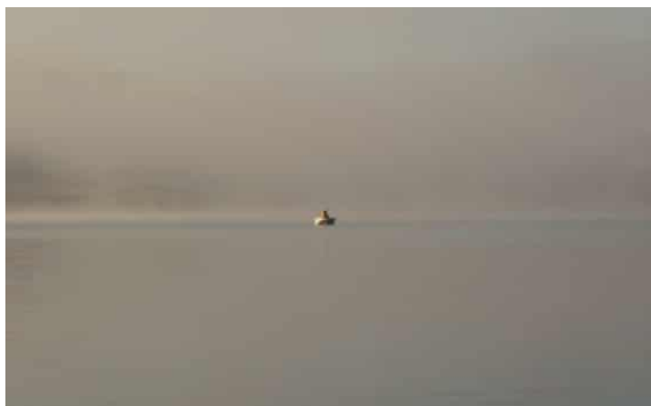
Jon V - This photograph was taken on Lake Jindabyne near Kalkite one crisp mid-winter morning just after sun-up, and only moments before the mist lifted to reveal a perfect brand new day.