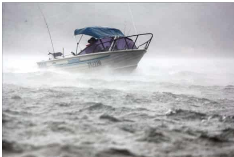
Burrinjuck Dam at midday on Saturday