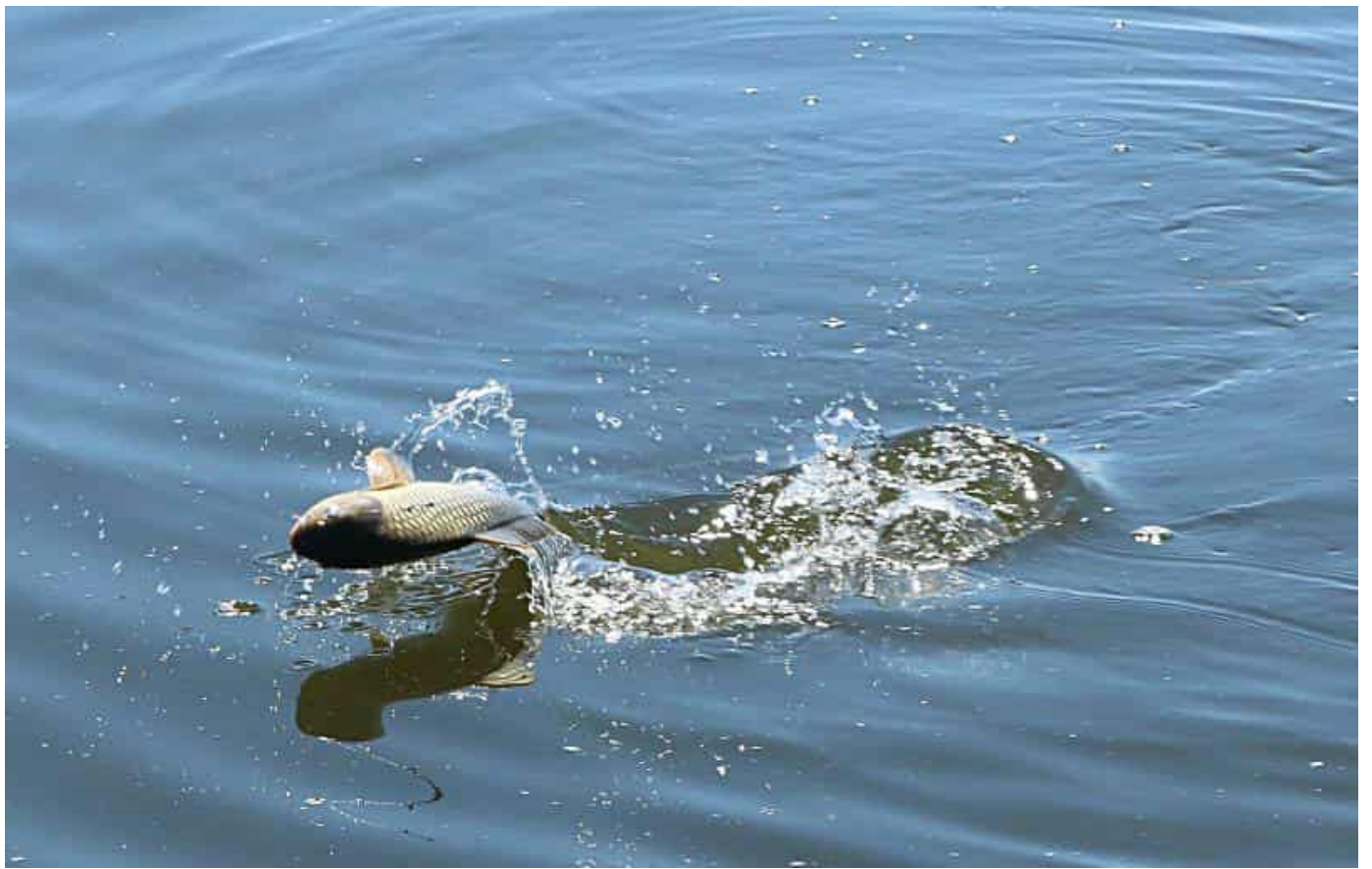
Glen Malam's 0.96 kg Carp going aerial.