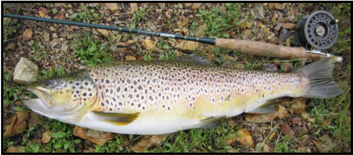
A well conditioned crayfish eating Eucumbene Brown

In an attempt to address this problem, freshwater crayfish have developed the ability to pre store a stock of calcium in their stomach. When the time comes to shed their shell and grow a new one they draw on this store to quickly harden up the new shell on their head and thorax. This is the important end because that's the part that protrudes from the burrow.