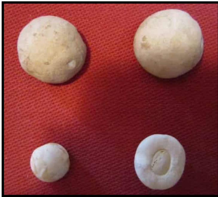
A selection of Eucumbene Brown Trout Gastroliths

Crayfish gastroliths are found inside crayfish and, more commonly, on the bottom of the lake long after the crayfish that formed them has been consumed by a trout, shag, or water rat. They are white half hemispheres of calcium carbonate with an indented flat centre, much like the cup of a mushroom after it has been detached from the stem. They are formed in pairs and two similar sized ones are often found in close proximity to each other.