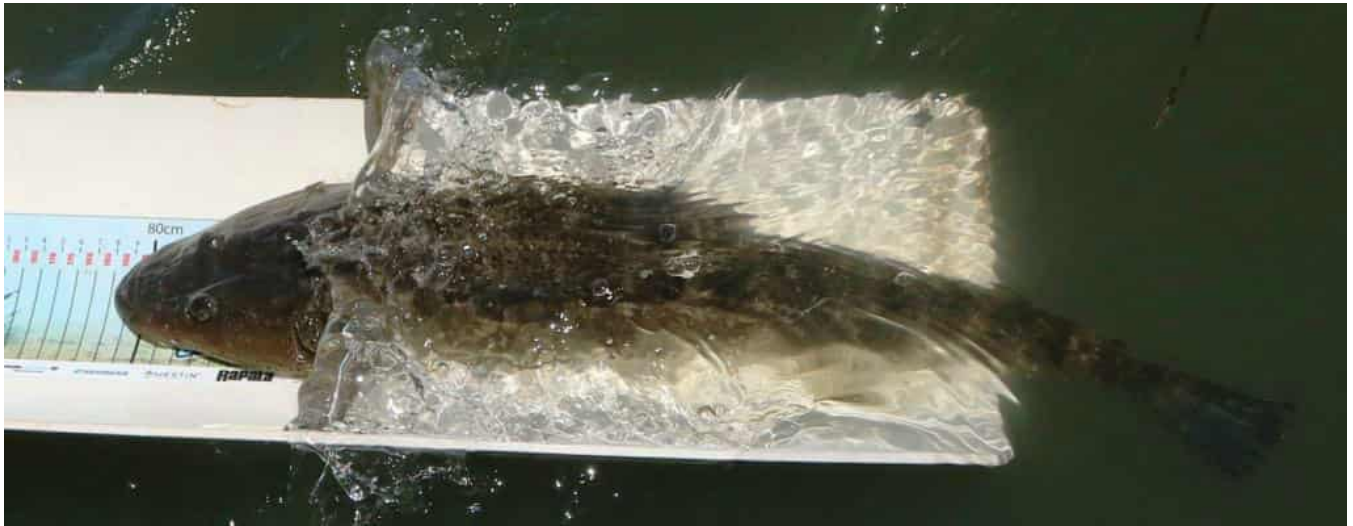
Chris Head's Flathead being released on day 3.

the final supper and presentation wondering if we retained our spot in the top 20.