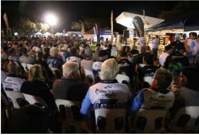
Over 500 people gathered at the Tournament HQ.