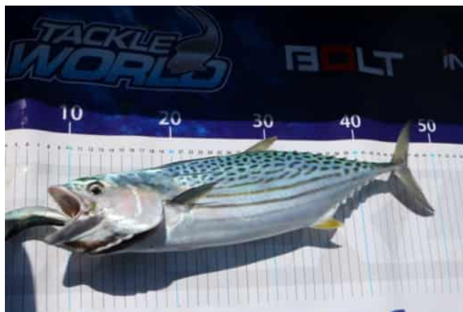
This Watson's Leaping Bonito spat out its breakfast just as its photo was being taken.