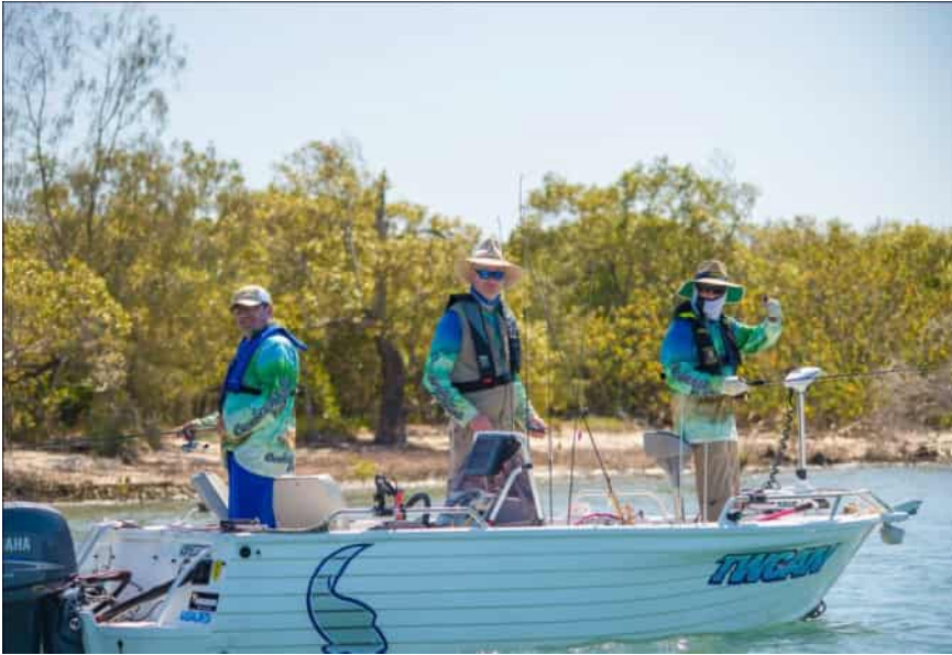
Team Canberra Fishos near the Pin.

when the 75 m barque Cambus Wallace ran aground on Stradbroke Island and its cargo of explosives detonated. This left a huge crater on the beach which eventually split Stradbroke Island into North and South Stradbroke Islands and creating the Jumpinpin Channel. Unfortunately, Team Canberra Fishos found this information of limited use when it came to locating and landing Flathead.