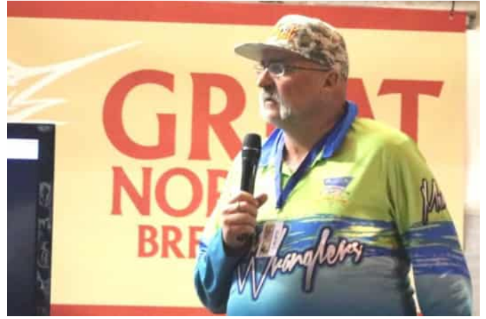
Merv Hughes offering some light entertainment for the crowd.

If you are interested in fishing the tournament next year, I highly recommend it. You will more than recoup your $225 entry fee from the lures and other goodies in the team show