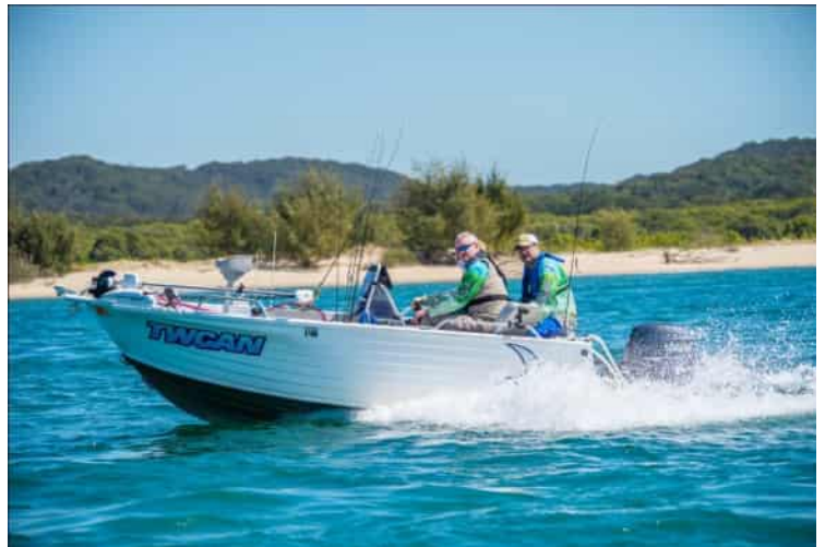
Team Canberra Fishos heading back from the Pin.

The Pin was very scenic and the water was a clear shade of Bombay Sapphire Gin. However, it was crowded with boats and we soon discovered that our one ounce jigheads was no match for the currents. So we had a morning tea break and returned to Chris' special Flathead spot.