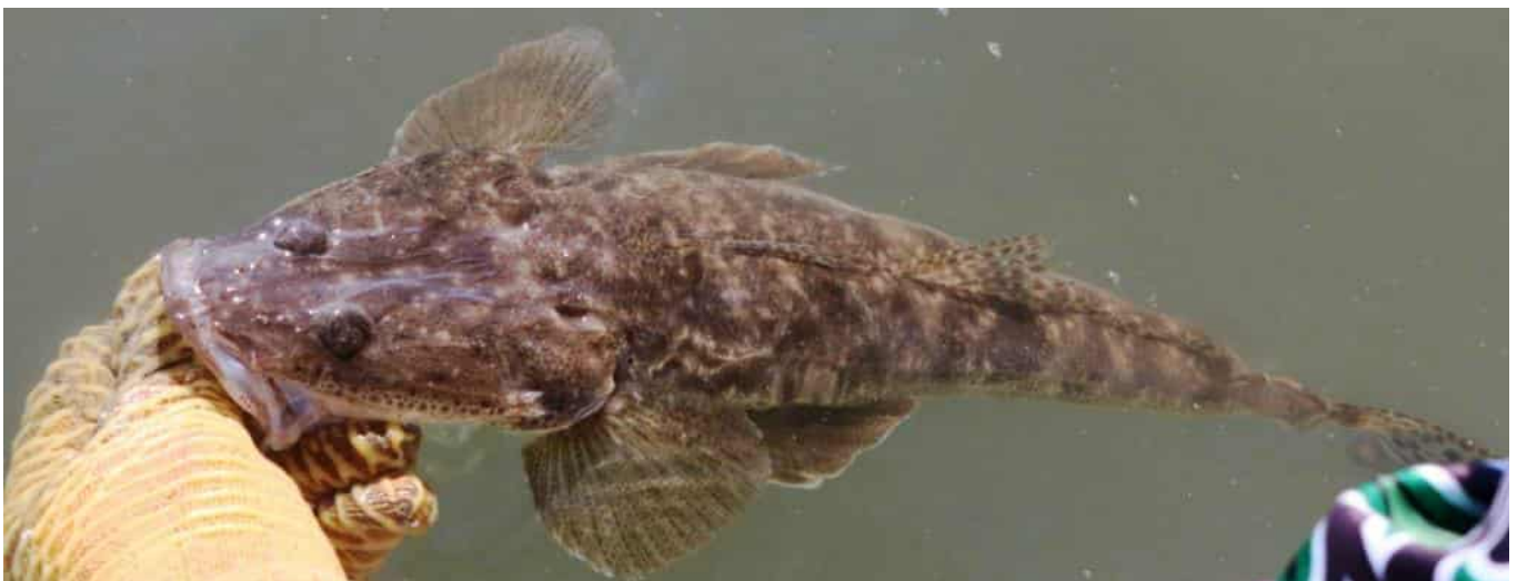
One of several fish Chris caught and released at the special Flathead spot.

While it was not as scenic as the Pin and less likely to hold metre long lizards, the special Flathead spot immediately produced fish. Chris caught and released six fish (the biggest