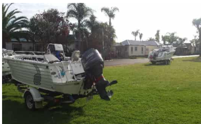
Saturday morning looks great – ready to go