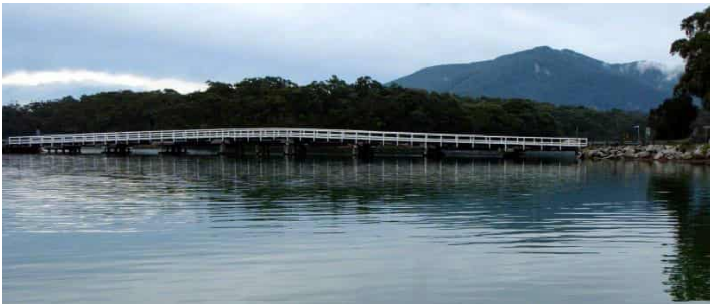
Jon V – Single Lane Bridge