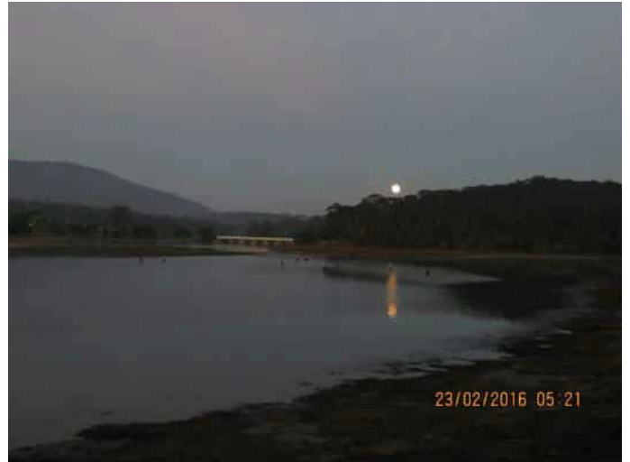
Keith S – First rays reflecting on the Corunna Bridge with the setting moon in the Western sky. Black swans already working the shallows for their daily sustenance.