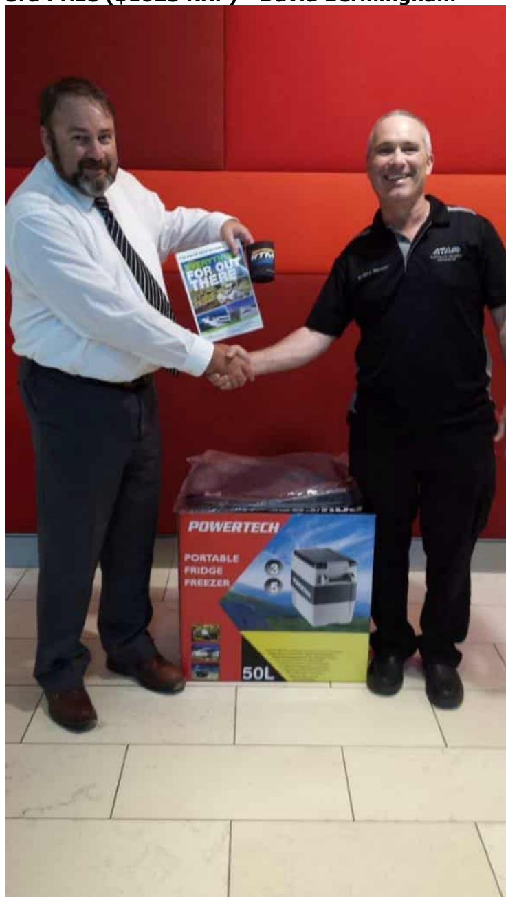
50 litre Powertech Portable Fridge/Freezer with Insulated Fridge Bag Sponsored by Road Tech Marine, Fyshwick.