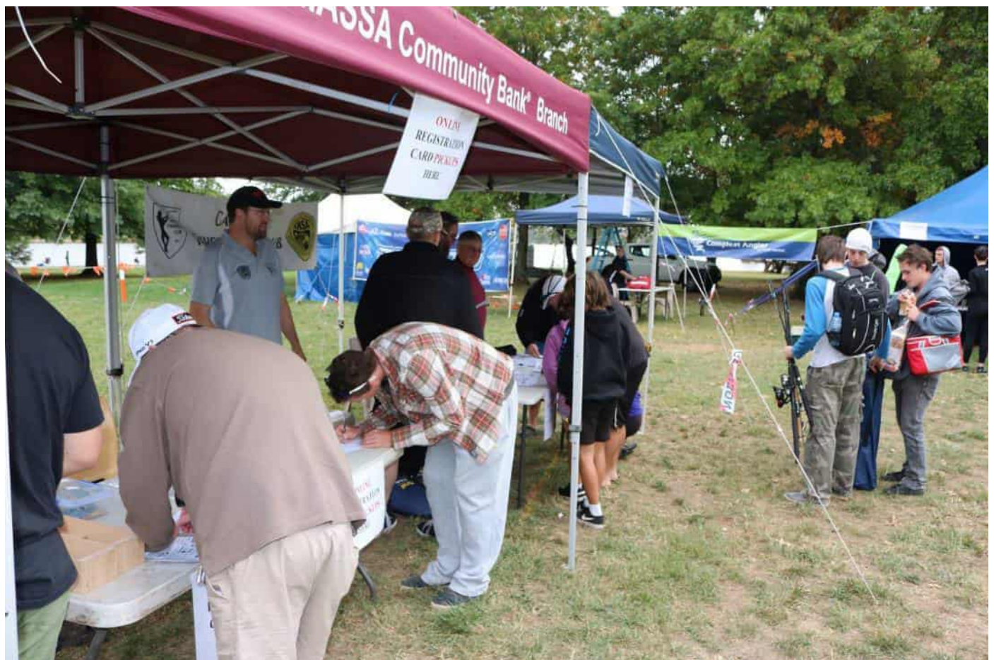
Anglers registering for the Carp-Out at Lennox Gardens.