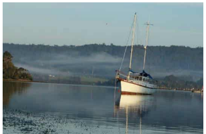
Anthony H – Morning serenity at Wagonga Inlet