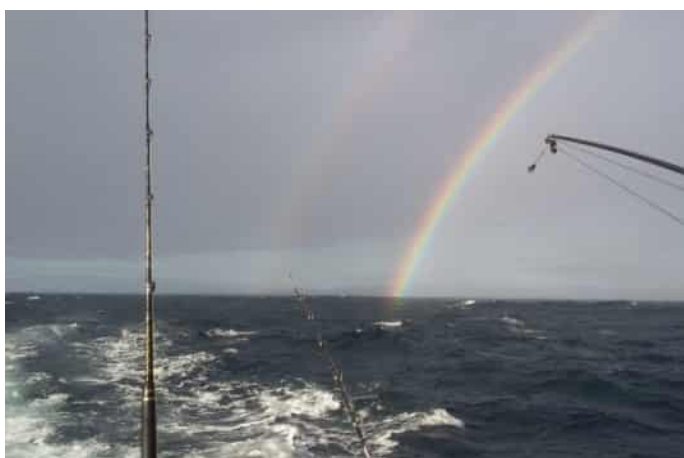
Chris H – Tollgates day 2 double rainbow