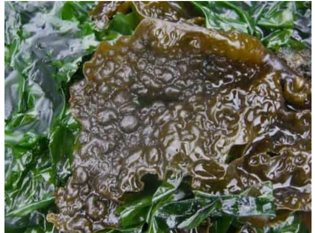
Sea Cabbage – Hedophyllum sessile (drummus attractus)

Now speaking of local knowledge, I have definitely learned a thing or two during my sessions at the Tomakin boat ramp. I generally like to head down there with a few cool ales and a few prawns – the serenity of wetting a line in this spot with a few quiet ales, regardless of what ends up on the line, is simply priceless in my opinion. On one of my recent sessions I was as usual minding my own business in my own little world. About 50 metres away from me I couldn't help notice this old bloke who, what felt like every time I turned around, was getting some very good action on his rod (that when I got a closer look, was probably as old as him). I later found out that he was 87 and had been fishing the same spot for 65 years. After a good hour, we had each pulled in a similar number of fish but in contrast to my efforts, all of his were keepers. What to me was the bigger surprise was the species – drummer. I know drummer are vegetarian and I have only caught them as a by-catch, but I still had to ask what he was using. 'Sea Cabbage' was his answer. I can sense my veteran readers having a 'well duh' moment but it should be said that there comes a point in everyone's life (hopefully countless points that happen over the full duration) that they become aware of something they were previously oblivious to – learning!