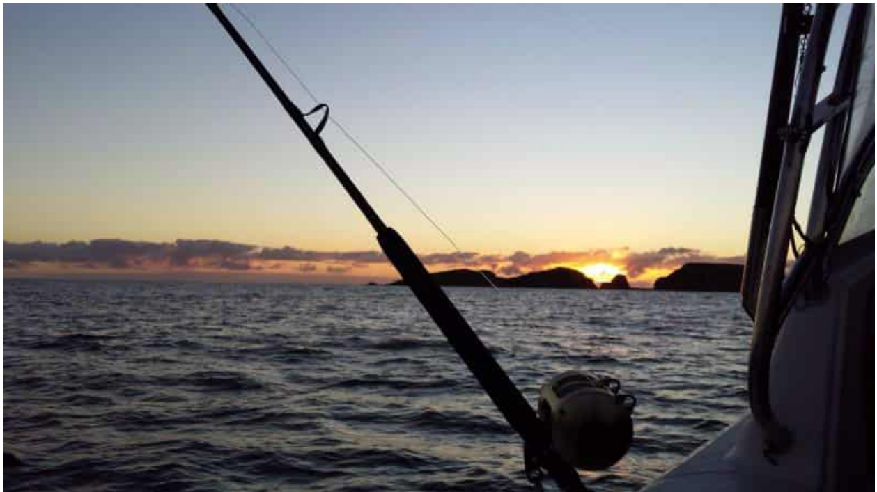
Chris Head - Tollgates day 3 sunrise

Winner of the January 2016 Photo Competition