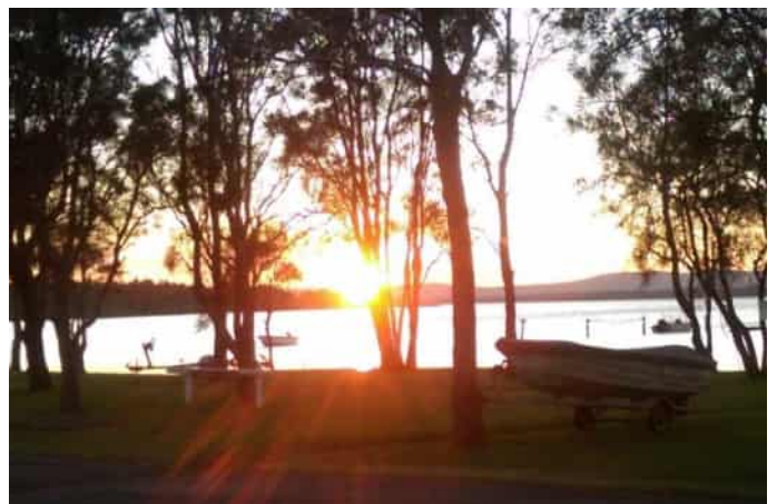
Danile M – Sunset over Wallis Lake