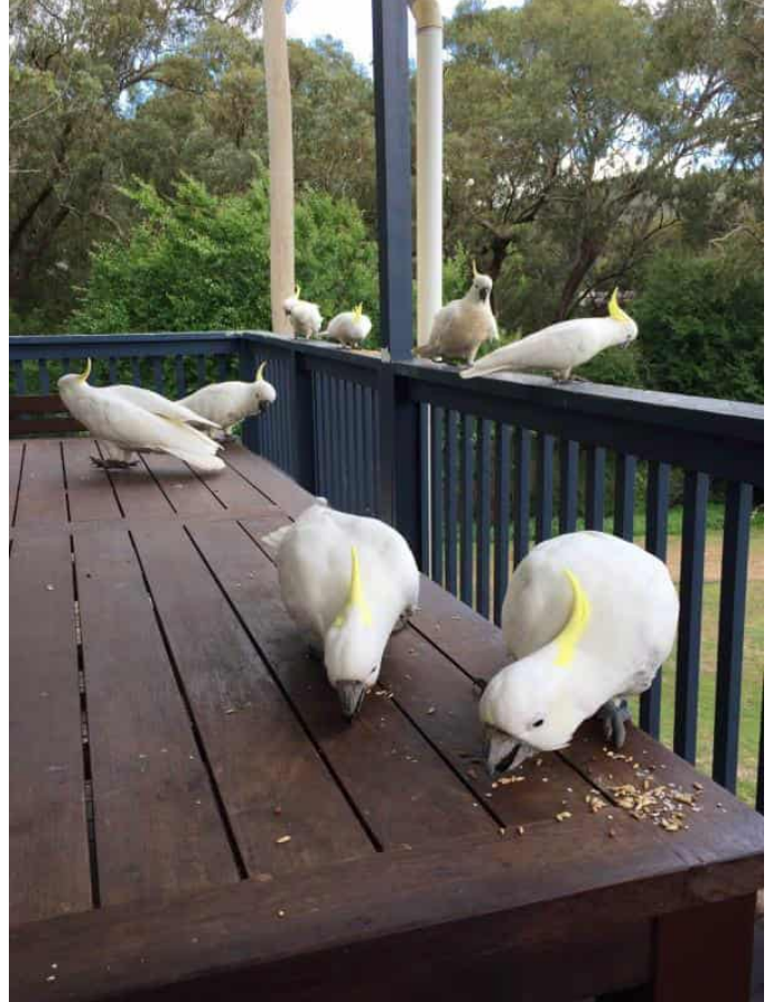
Jake B – Feeding cockatoos at Burrinjuck Convention