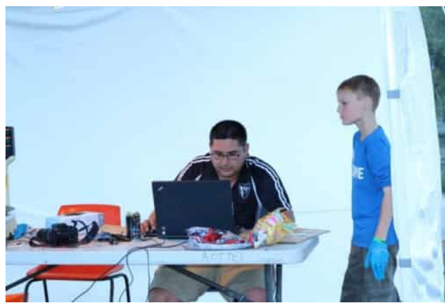
Getting by with a little help form my friends