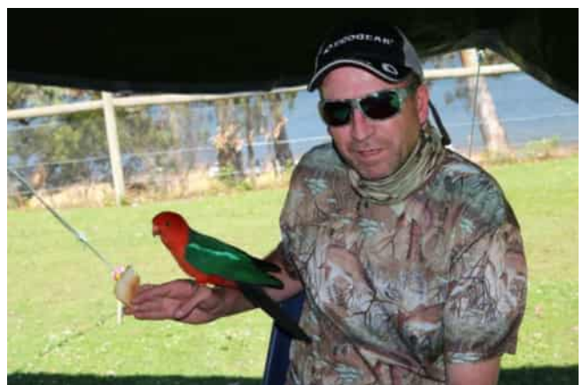
Now it's time for a... bird? from our sponsor.