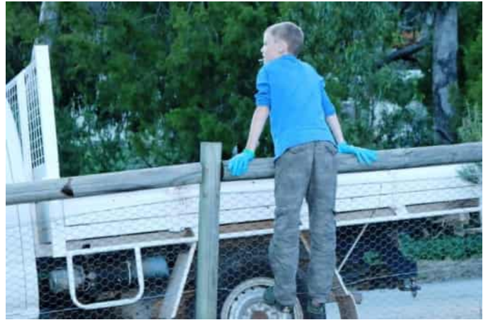
Truck's filling up boss!