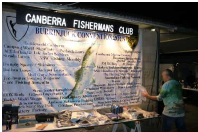
2015 BJC - Proudly supported by all of the above