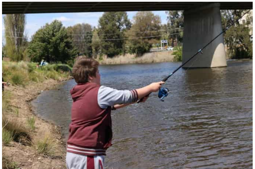
The fish didn't get the memo about National Gone Fishing Day. Strong winds affected many of the National Gone Fishing Day events held in New South Wales.