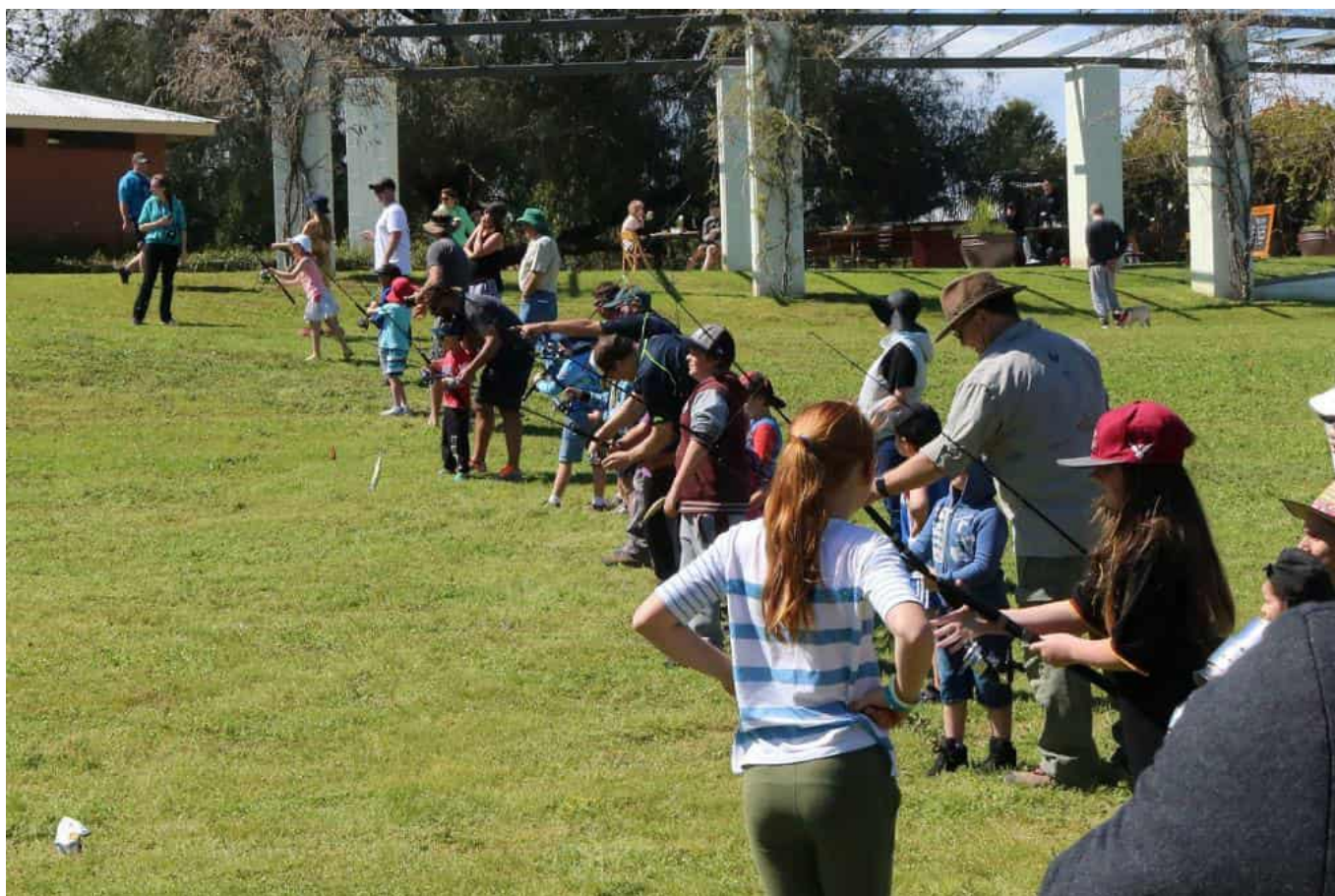
After learning to tie knots, rig fishing lines and bait hooks, the junior anglers were supplied with fishing rods and casting plugs to learn how to cast a fishing rod.

Unfortunately, many of the National Gone Fishing Day events in New South Wales was affected by strong winds and our event was also affected. Despite berleying the river before the clinic and providing corn, bread and worms for bait, no fish were being caught.