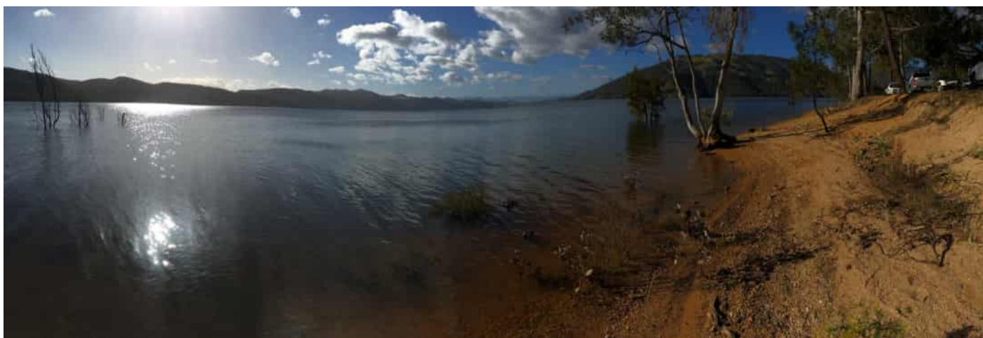
The winner of the November Photo Comp: Anthony Heiser – Day 3 of the Burrinjuck Convention