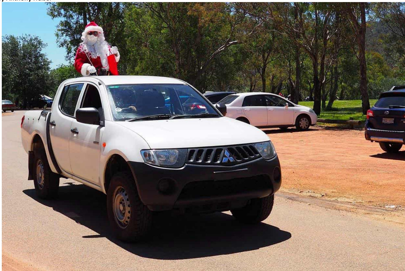
Santa drops by the CFC Christmas Party