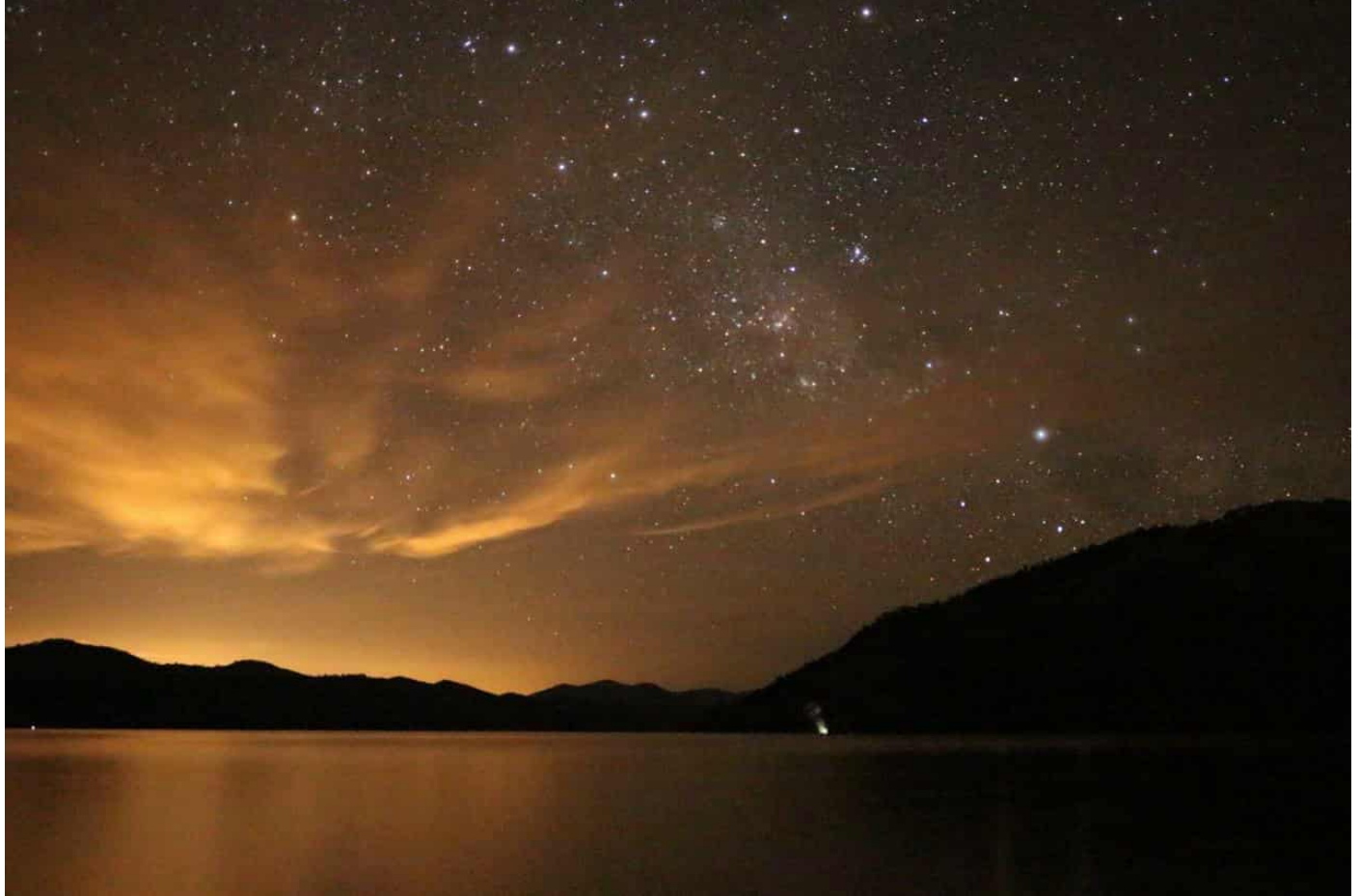
Southern Cross and the Milky Way rising over Lake Burrinjuck

The Sixth CFC versus Morven Inter Club competition was held on 2-4 December 2016 at Lake Burrinjuck. Both clubs were well represented by a contingent of anglers vying to win one of the trophies for longest Golden Perch, longest Murray Cod and the trophy for the club with the longest aggregate length of natives caught.