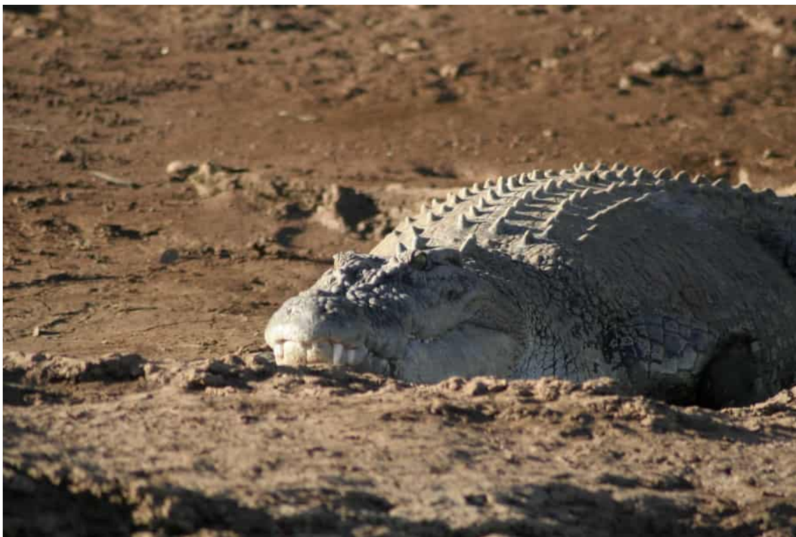
You will need a DSLR with a decent telephoto lens to get great wildlife shots as most animals will be too far away for a smart phone or compact digital cameras. In some cases, you might get close enough with your smart phone although most animals will flee if you do. Others might eat you if you get too close like this six metre Saltie on the banks of the Victoria River.