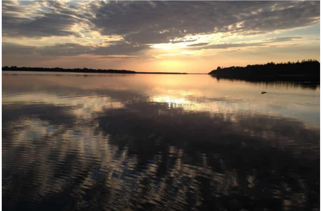
Coila Lake an hour after sunrise taken with my iPhone. Smart phones can take stunning wide-angle scenery shots providing there is adequate lighting.

Regardless of the type of camera you use, you need to know how to compose a photograph. The basic techniques for composing good photos applies to all cameras. I'll share some of those techniques in Part 2 of this article in the next newsletter.