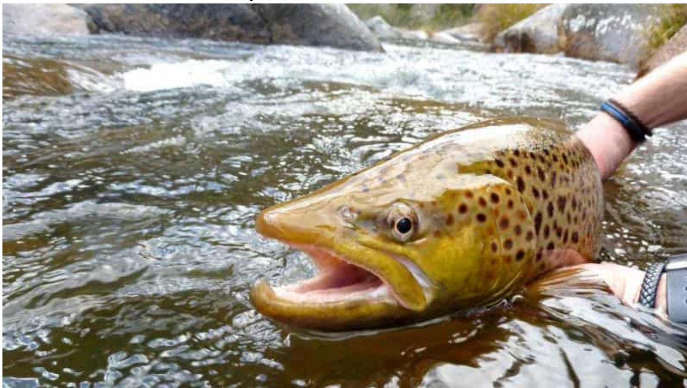
Phil Lawrence: Eucumbene River Buck Brown Trout keen to be released