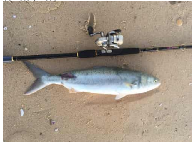
Anthony Heiser - Christening the new surf rod at Cemetery Beach