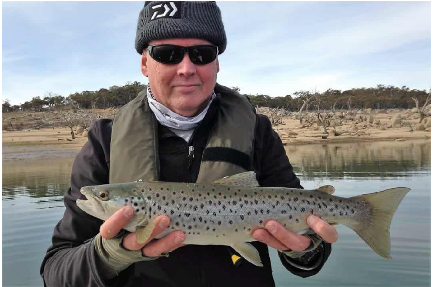
Lemmo – 50cm brown – Wainui Bay – check the glass calm conditions.

Hitting the road early in the fog and frost we found the track down to the ramp which wasn't the best for sedan but we made it. The ramp was just out of the water but some gravel and rocks off the end. We launched no worries and headed off in the fog for Wainui Bay trolling on the electric dodging rock reefs and hidden snags along the dead trees. Water temp was a freezing 5.9 degrees Celsius.