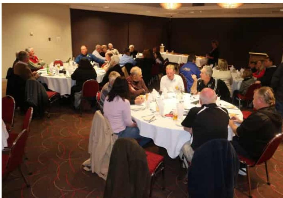
Fifty-five people attended the ANSA Presentation Night

A total of 55 people attended the presentation dinner and quite a few awards were handed out. As to be expected, the evening clearly belonged to Wollongong Sportsfishing Club . I lost count of the number of awards they collected (including Champion Club) but it was certainly an impressive haul.