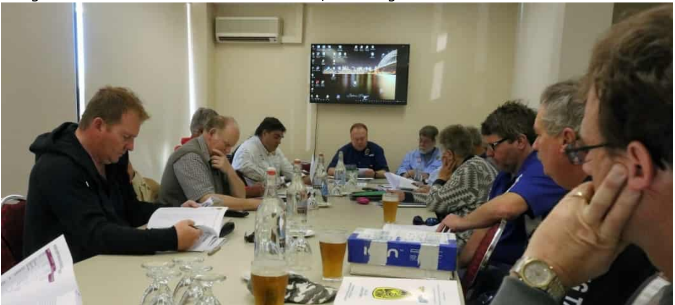
The ANSA NSW Delegates Meeting and AGM at Eastlakes Football Club

The 2016 ANSA NSW Delegates Meeting and Annual General Meeting, followed by the Presentation Night, was held on 27 August 2016 at the Eastlakes Football Club. For our new members who may not be familiar with the Australian National Sportsfishing Association (ANSA), it is the peak body for sportfishing in Australia and represents recreational anglers through various branches and affiliated clubs, including our Club.