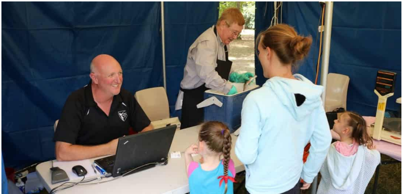
The outgoing Recorder and the incoming Recorder working together at the Carp-Out Weigh-in Tent, 3 April 2016.