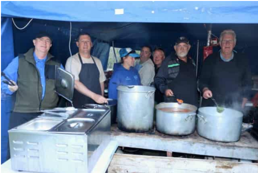
Saturday night dinner shift