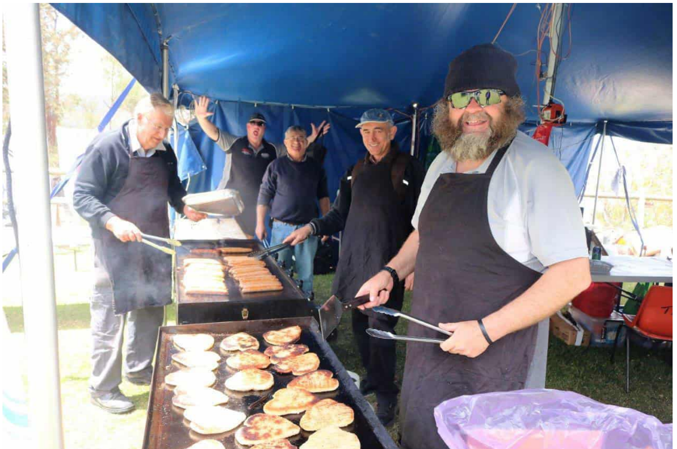
Sunday Lunch Crew