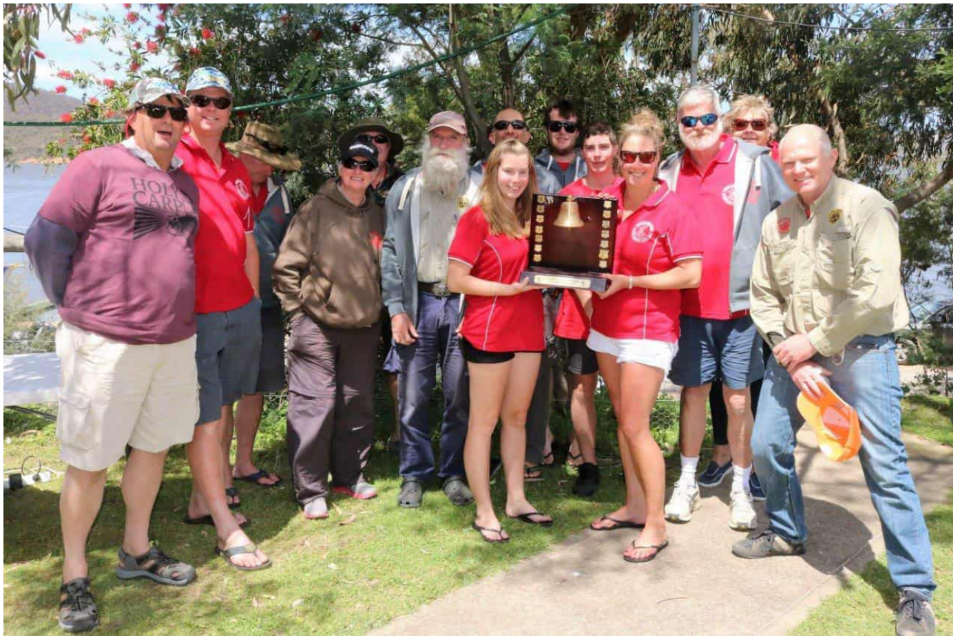
Congratulations to the Wollongong Sportsfishing Club.