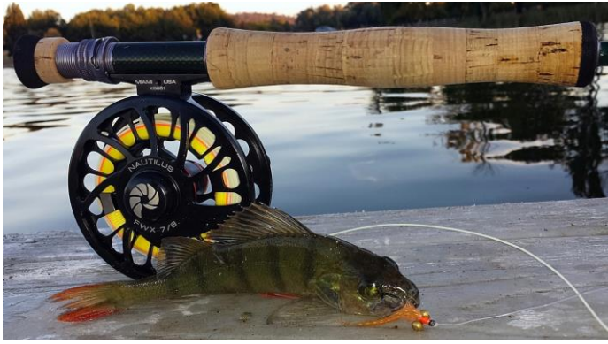
Jon Vogel: PB LBG Redfin on fly 16.0 cm 0.15 kg