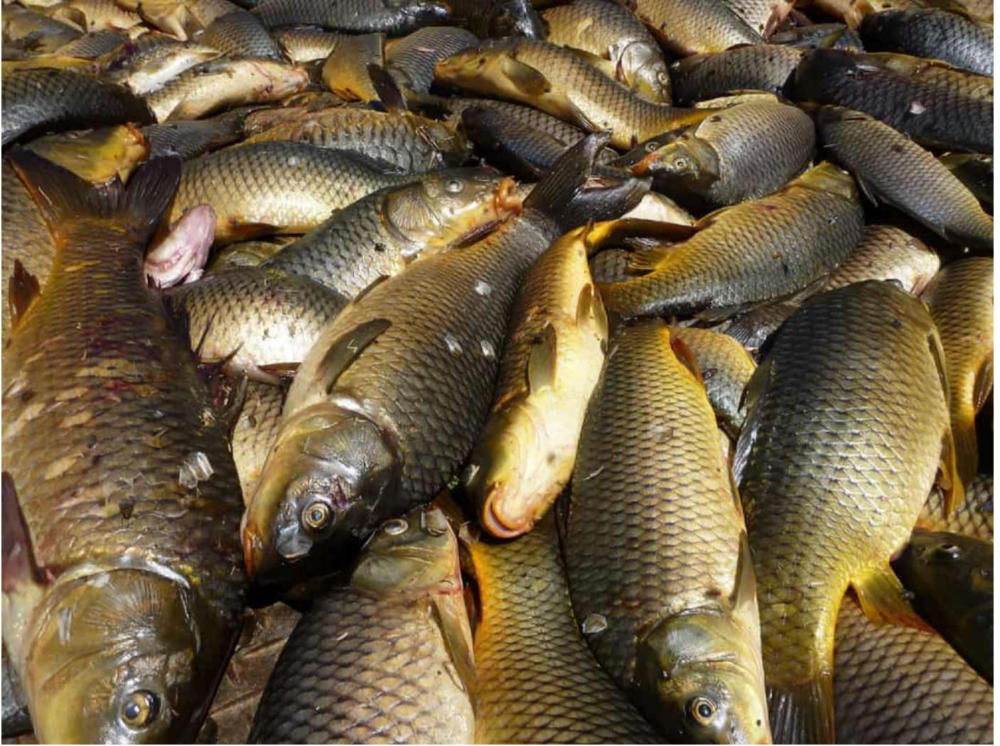
The back of the ranger's ute at the 2009 Burrinjuck Convention.

In the May 2016 General Meeting, the members voted in favour of the Club supporting the release of Cyprinid Herpes Virus (CyHV3) to reduce the Carp population in Australia provided the Government adequately funds the clean-up of waterways of dead and dying Carp, habitat restoration and restocking of native fish.