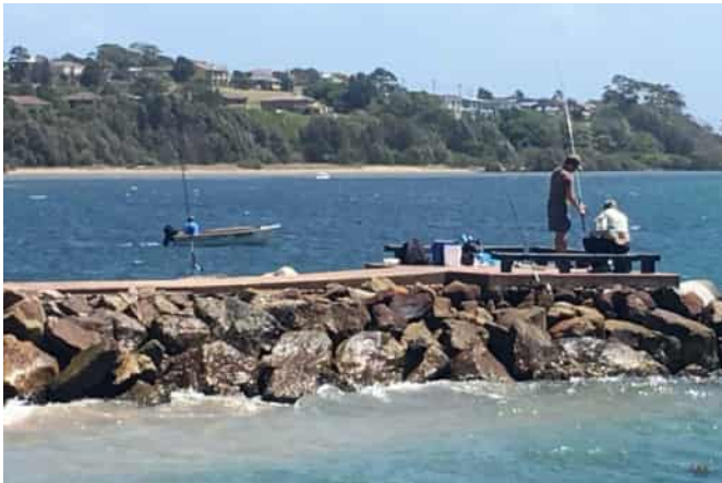
Off in the distance, someone has had a very bad day!