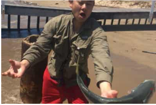
The photoshoot didn't go to plan!

By the time we got to the pier, the wind was howling at 20 to 25 knots. One by one, we watched boats from Botany Bay Sportsfishing Club and Wollongong Sportsfishing Club make their way back to the boat ramp, although many did get to tag and release a few Marlin beforehand.