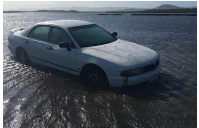
A closer look at the poor car at low tide.