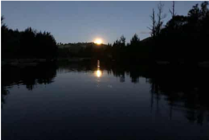
Supermoon on the Bidjee