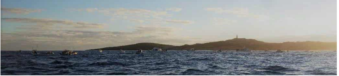
The Montague Island Shopping Centre Car Park!