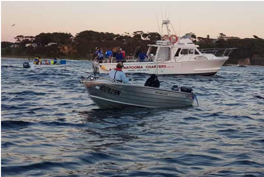
The Flotilla at the baitfish grounds. (Ed - did the two guys in the photo really take their little dinghy out to Montague Island????)

At 6 am Saturday morning, Kevin and I headed out to the Narooma boat ramp for our rendezvous with the now famous Stacey Charters down the south coast. The target fish for the day was Kingies and by 6:30 am, we were on the water and heading across the bar with Chris Guion and Rebecca in Chris's boat following us out to the bait grounds.