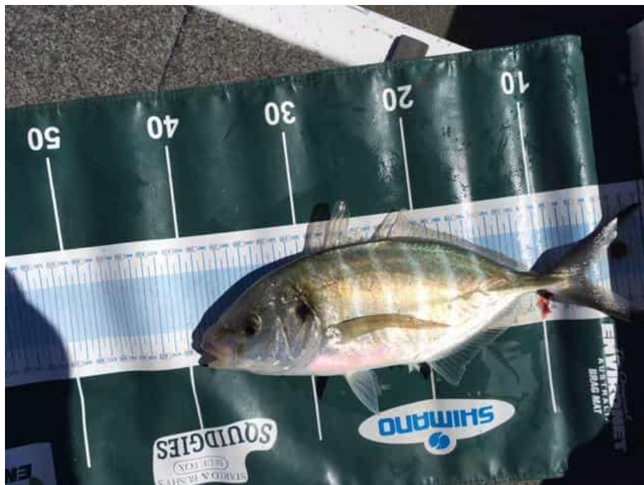
Silver Trevally at Wagonga Inlet