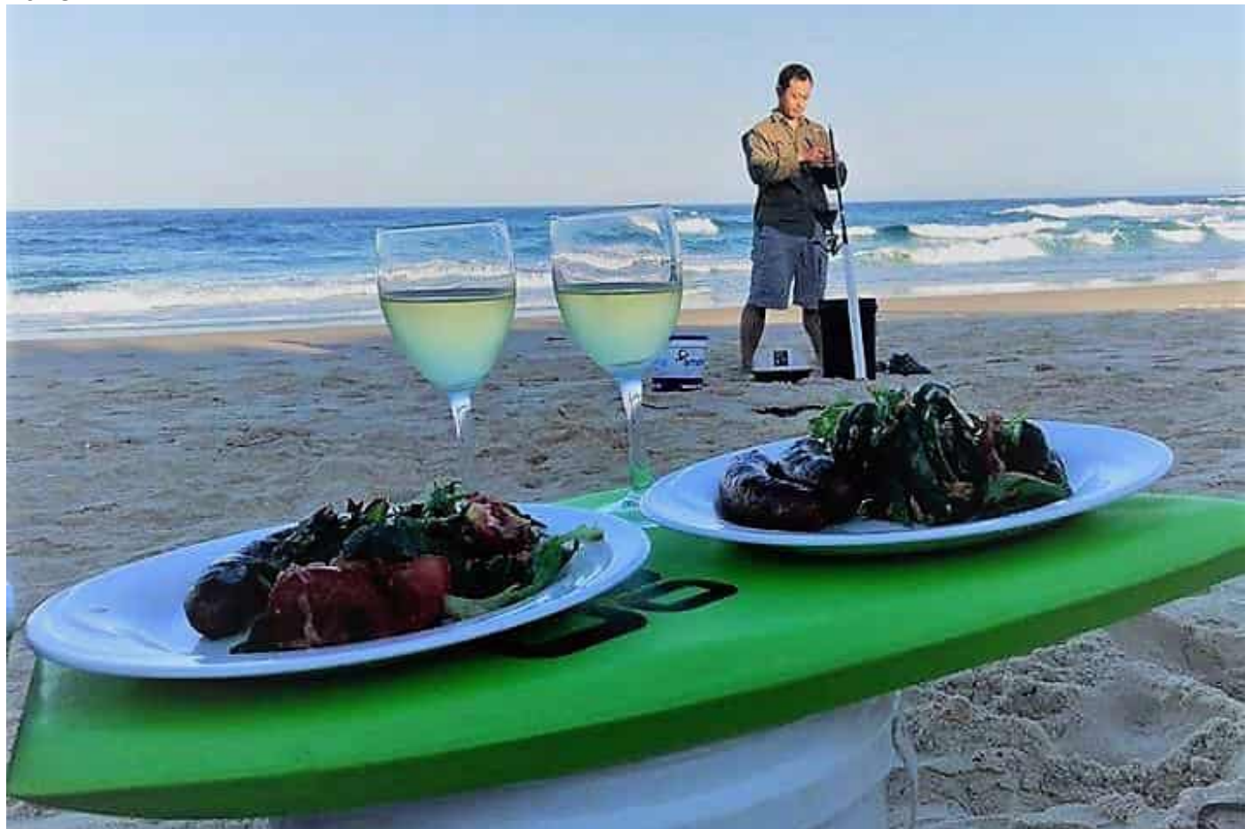
Afternoon tea by the beach.