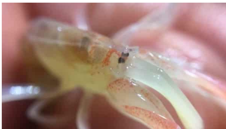
The nippers Zach and Zane pumped fed a lot of Leather Jacket and undersized Bream & Luderick over the Queen's Birthday

After a quick brunch, we decided to prospect around the bridge on the oyster shop side. The aim was to help Zach fish so that he wouldn't lose interest. But we found the current to be quite strong so we ended up following the dangling nipper downstream as we walked up and own the short path under the bridge with not much luck even though I could see fish swimming around.