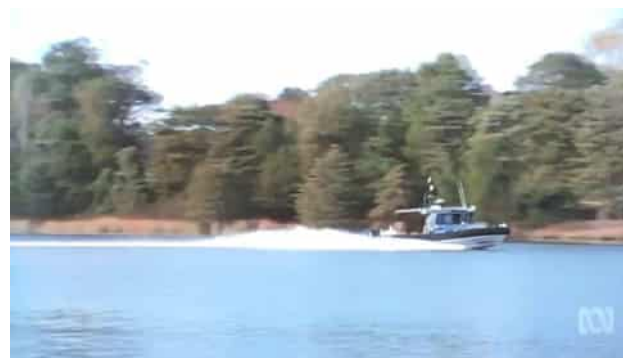
ABC News camera captures the Water Police heading out to apprehend the tinnie motoring around with an outboard motor.