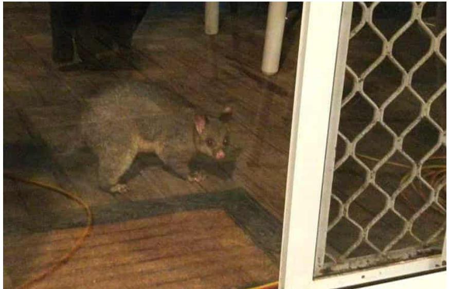
A local Brush Tail Possum invited itself over for the Saturday Night BBQ!

We ended the day having a nice steak, snags and veggie dinner while Zach had fun feeding the local possum who visited our cabin that night.