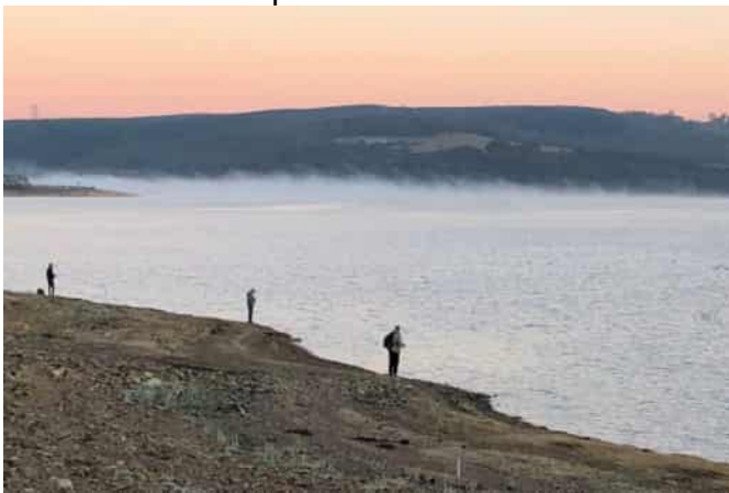
Anglers at Thompsons Creek Dam.

That was the last Convention for the 2017-18 fishing year. The next ANSA Convention, the first for 2018-19, will be the ANSA Glenbawn Convention hosted by Newcastle Sportsfishing Club on 14-16 September 2018.