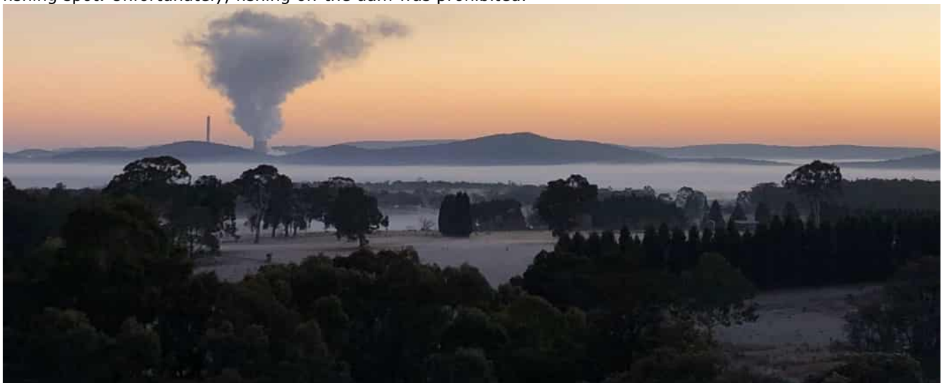
Mount Piper Power Station viewed from the wall at Thompsons Creek Dam.