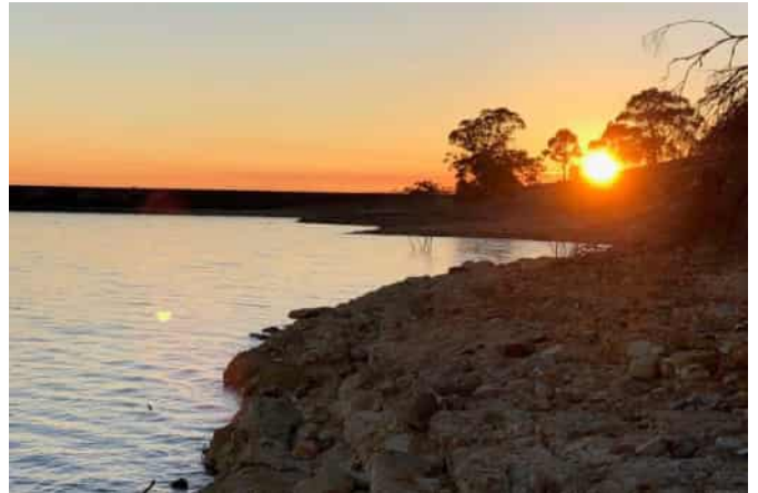
Sunrise over Thompsons Creek Dam.