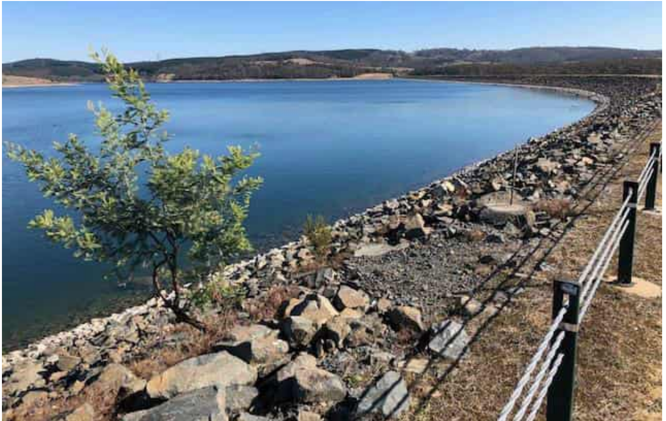
Thompsons Creek Dam – I spotted 7 rather large Trout cruising along the Dam wall as I was walking to my fishing spot. Unfortunately, fishing off the dam was prohibited.

After my first session at the dam on Friday afternoon, I decided to spend the entire weekend there, notwithstanding its reputation as a tough fishery. The water was pristine, compared to Lake Lyell, and I spotted many large trout cruising the lake. Unfortunately, I did no good but,