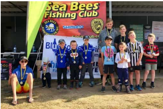
Junior Anglers receiving Participation Awards.