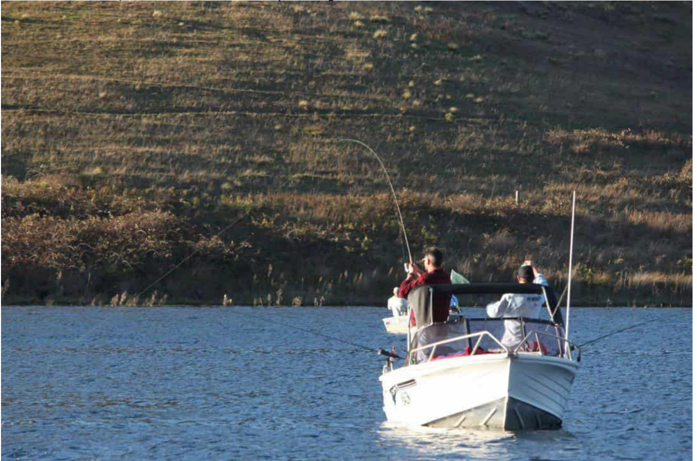
An angler from Sea Bees Fishing Club reeling in a nice Redfin Perch at Lake Lyell on Saturday afternoon.