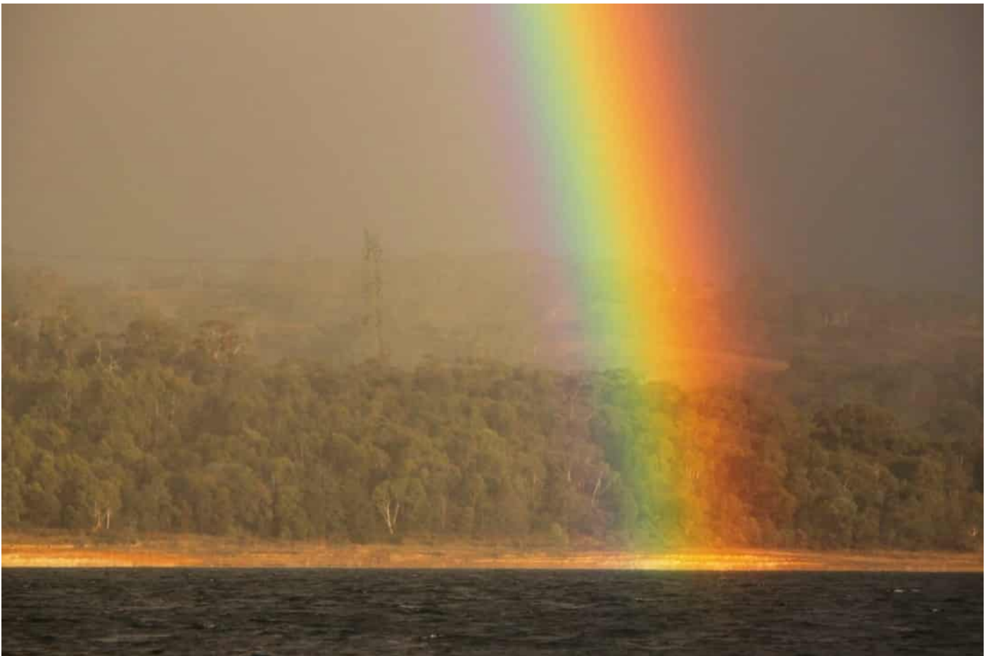
Rainbow over Thompsons Creek Dam on Sunday morning.