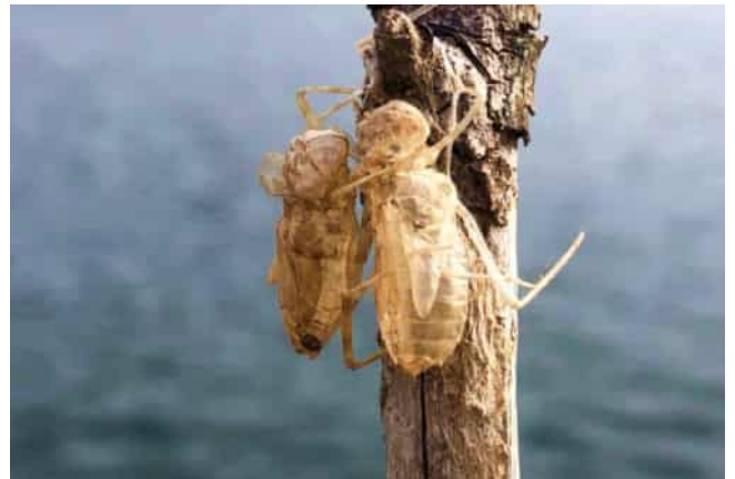
Mudeye exuviae or shells hanging off a branch at Thompsons Creek Dam. No wonder the trout at Thompsons Creek Dam grow so big!